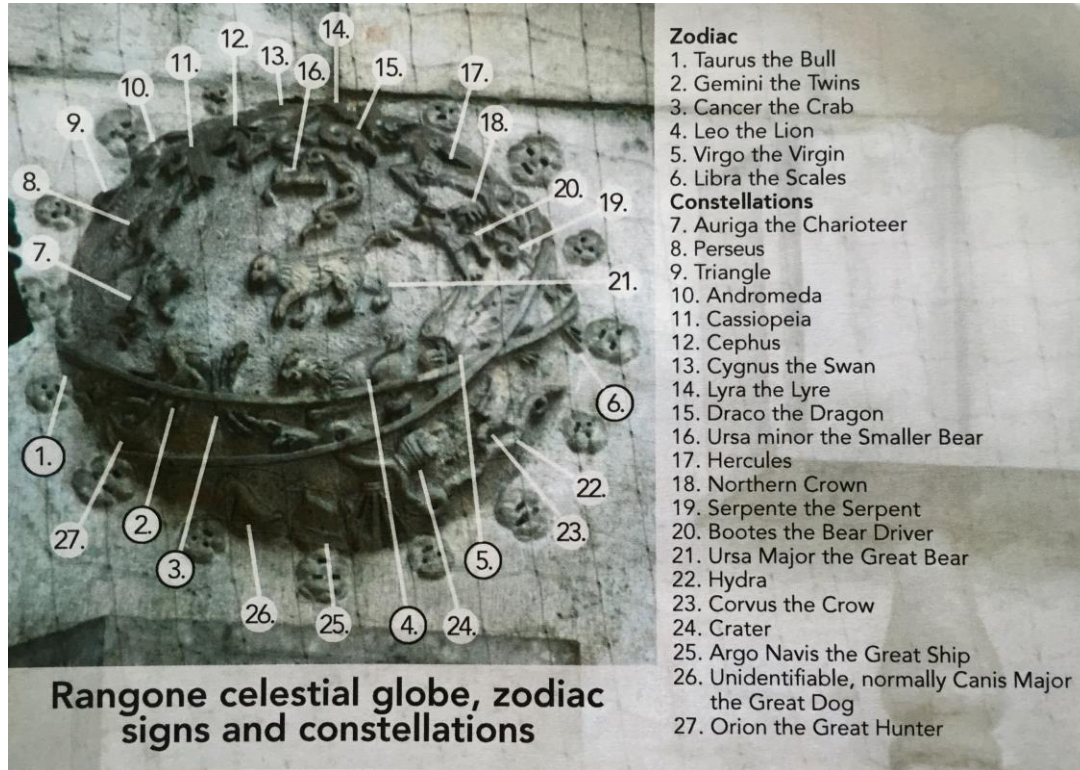
Fig. 3. Zodiac and star constellations on the celestial globe, detail of the Tommaso Rangone Monument , S. Giuliano, Venice, completed 1557, installed c. 1558 (Photo: Public Domain with diagram by Jeffrey Brewer).