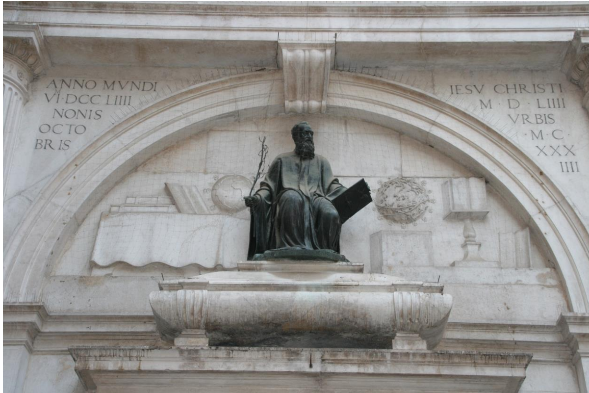
Fig. 1. Alessandro Vittoria, Tommaso Rangone Monument , S. Giuliano, Venice, completed 1557, installed c. 1558.