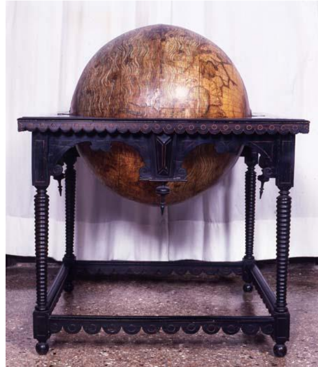
Fig. 4. Livio Sanuto (attr.), Globe, c. 1574 (nineteenth century cradle), Museo Correr, Venice.

Livio Sanuto," La Bibliofilia 48 (1946): 26-27; R. A. Skelton, A Venetian Terrestrial Globe, Represented by the Largest Surviving Printed Gores of the 16th Century (Bologna: Garisenda Antiquariato, 1965); Rodney W. Shirley, The Mapping of the World: Early Printed World Maps 1472-1700 (London: Holland Press, 1983; reprint 1987), 151-155; Scruzzi, Eine Stadt , 151.