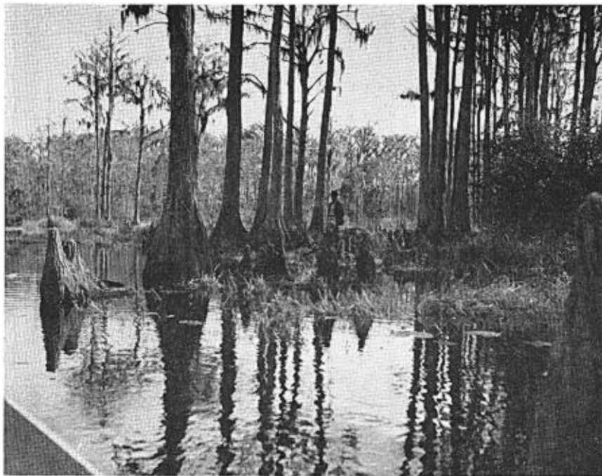
FIG. 1.—Pondcypress in the Okefenokee Swamp, typical of the 15,000-acre stand.

Bee Branch. —A most fascinating tract is the Bee Branch NA in the Bankhead National Forest of northern Alabama, recently reclassified from a Scenic Area to assure its perpetuation in an undisturbed condition. Most of