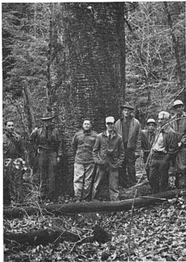
FIG. 2.—The Bee Branch Natural Area in northern Alabama lies in a limestone gorge surrounded by sheer cliffs 100 feet high. Yellow-poplar-hemlock and yellow-poplar—white oak—northern red oak are the principal types.

The present stand contains as much as 34 MBM (Scribner) per acre of sawtimber, gross scale, without deduction for the prevalent interior red-heart and butt rots. Trees exceed 125 feet tall and have more than 6 merchantable logs. Shortleaf pines average 5 feet shorter than the loblolly. Pine basal area approximates 70 square feet per acre and the understory hardwoods contribute another 30 square feet. As the pines are gradually succumbing, due to breakage and windthrow, the stand is undergoing transition to the loblolly pine-hardwood (82) type and eventually is expected to be characterized by beech-southern magnolia (90). Oaks, hickories, and elm are noticeably absent and pines do not occur in the understory.