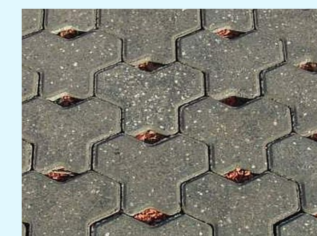
Example of Permeable Pavement

http://watershedfriendlysurfacealternatives.files.wordpress.com/2013/04/082109-permeable-pavers.jpg