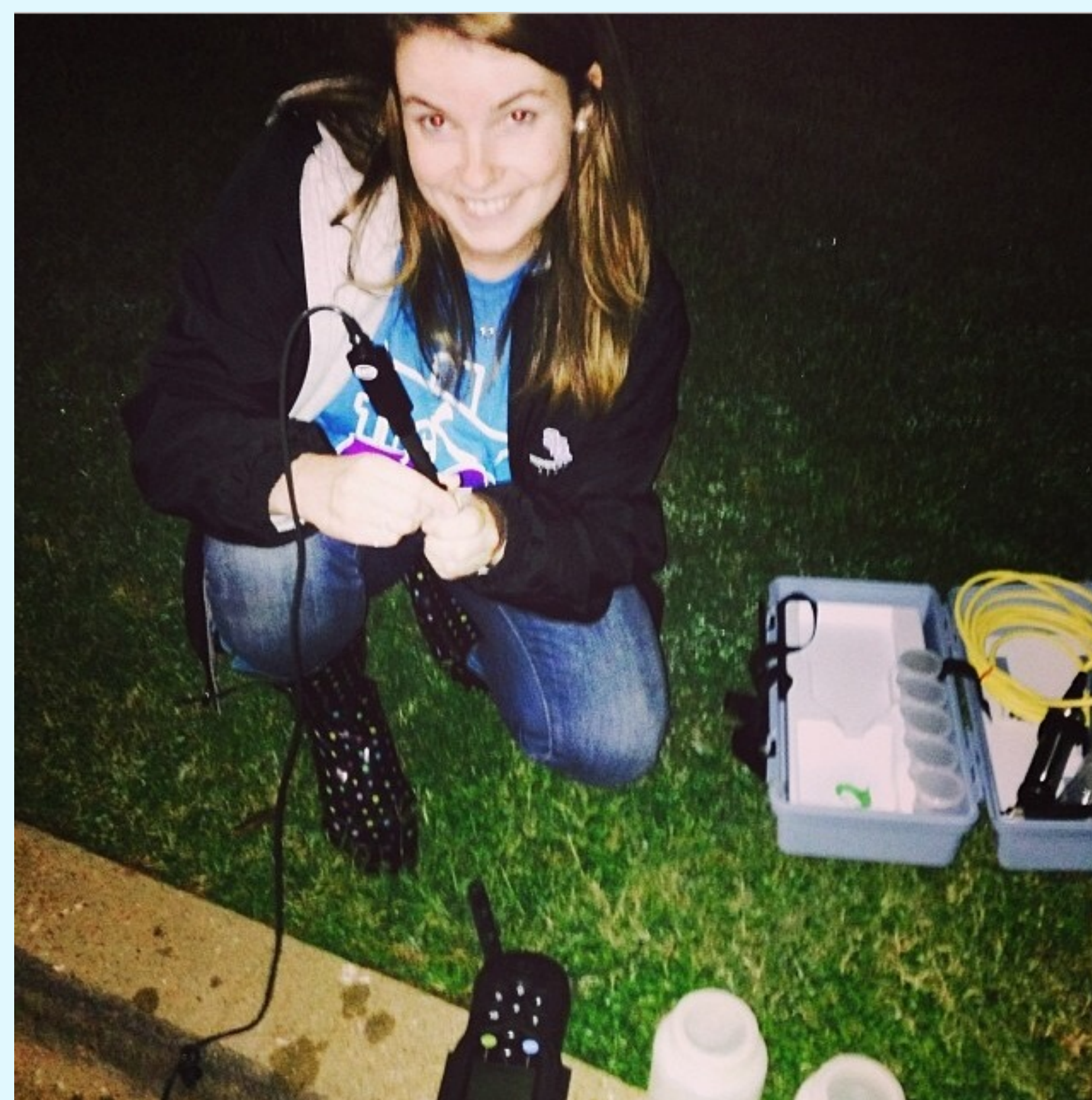
Collecting water samples

To conduct our experiment, we had three sampling days that took place after a rainstorm. Before leaving to take our samples we made a field blank using distilled water, and took the blank with us and stored it with the other sample bottles. We took the pH and dissolved oxygen reading on site using the HQd portable meter, at each of the three parking lot locations. We also took a bottle of sample water at each site and brought them back to the lab for testing. In the lab, using the spectrophotometer and Hach reagents, we tested for total alkalinity, lead, and copper.