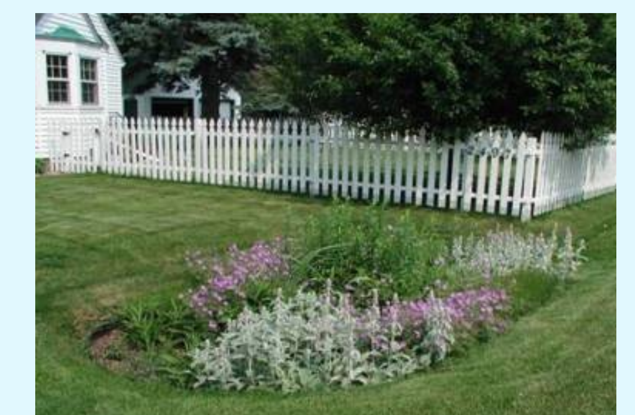
Example of a Rain Garden

http://watershedfriendlysurfacealternatives.files.wordpress.com/2013/04/082109-permeable-pavers.jpg