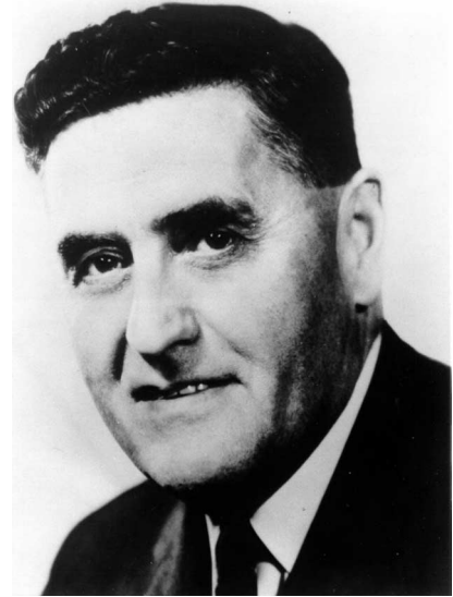
Left: President John F. Kennedy (r) with Democratic Senator John C. Stennis (l) in February 1961. During his election campaign, President Kennedy pledged to support forestry and forestry research. Right: Representative Clifford G. McIntire was a Republican Congressman from Maine from 1951 to 1964. He helped draft legislation later approved by the 87th Congress and submitted for Presidential signature as H.R. 12688. Rep. McIntire considered the M-S legislation the highlight of his political career.