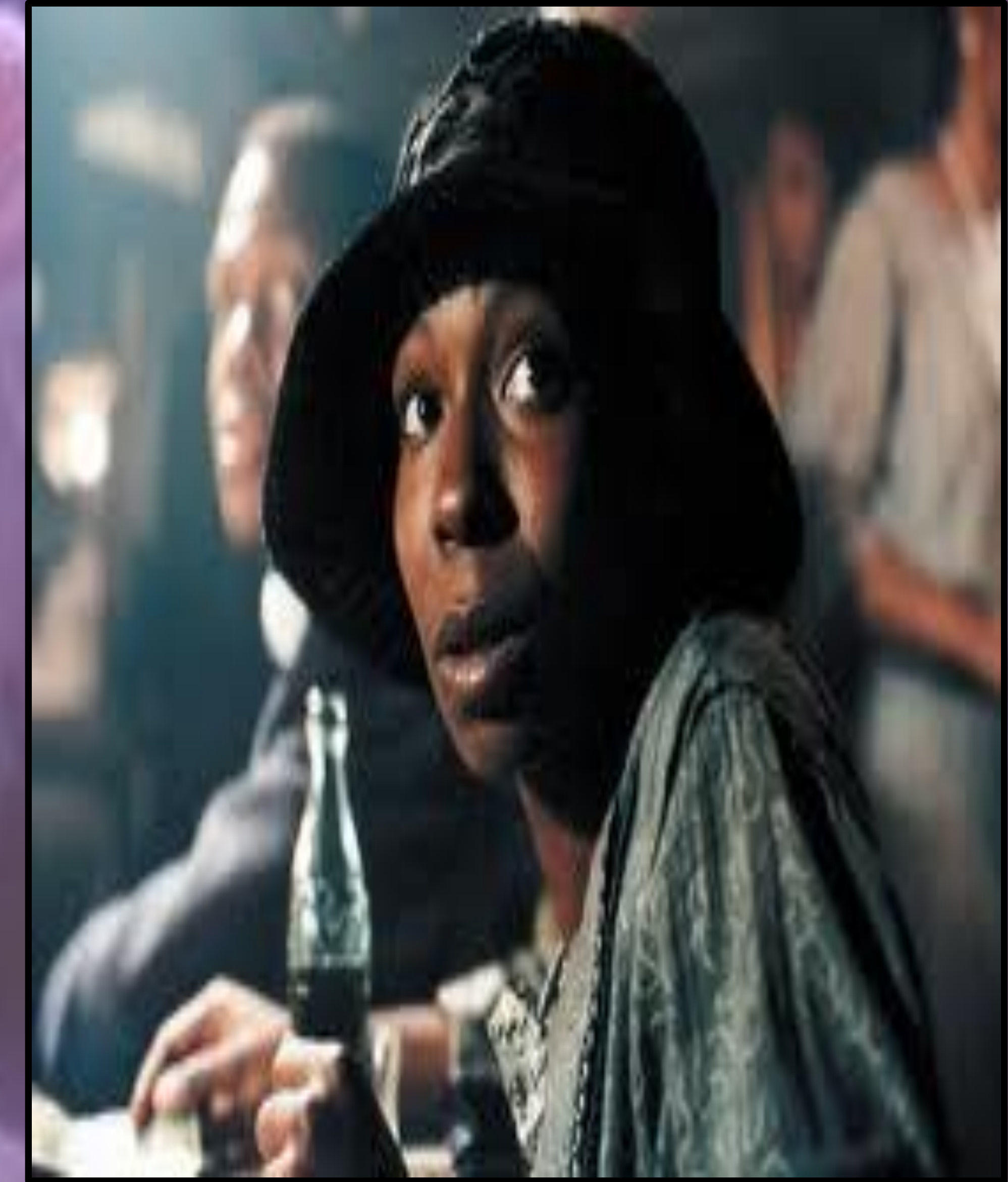
(Whoopi Goldberg plays the character of Celie)