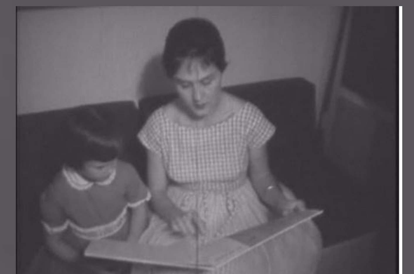
A still from the short film: Target: Austin, TX

Provided with 3 articles on the paradox of civil defense in the 1950s, I analyzed the hypotheses of three scholars and tested their hypotheses by analyzing primary sources, such as articles, short films, songs, etc. In doing so, I was able to better understand the psychological effects war has on our nation.