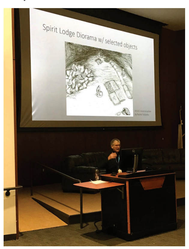
Figure 2. Dr. George Sabo III presenting the keynote address.

archeological record? This presentation explores links between Caddo narrative traditions and artistic representation, using examples from fifteenth-century storytelling performances at the Spiro Ceremonial Center and early seventeenth-century performances by a coalescent community resident in the Carden Bottoms locality of central Arkansas.