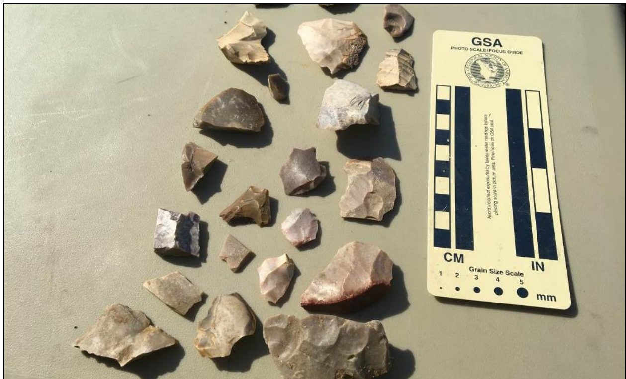
Figure 6-8. Representative lithic debitage assemblage observed on site 41WB842