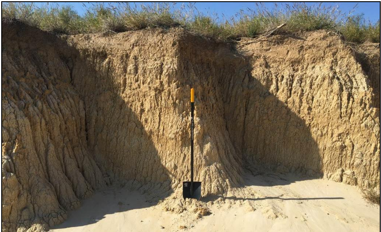
Figure 2-4. Borrow pit located at the southeast corner of the Project Area, facing west