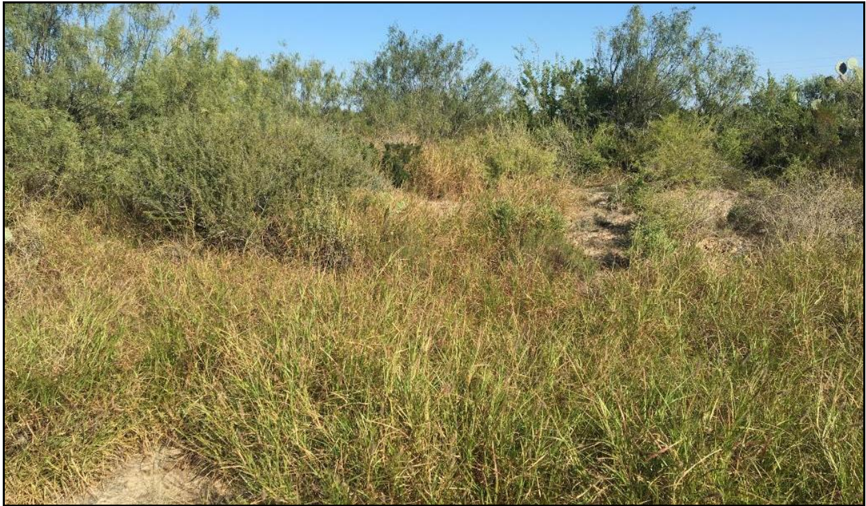
Figure 2-3. General view of Project Area, facing east