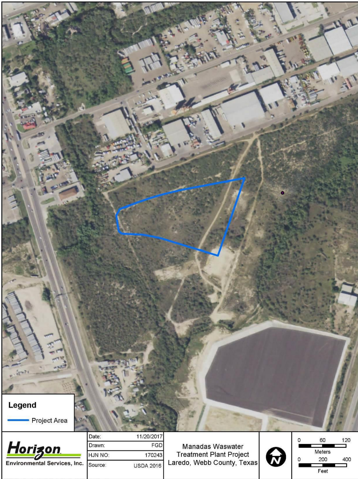
Figure 1-2. Aerial photograph depicting the location of the Project Area