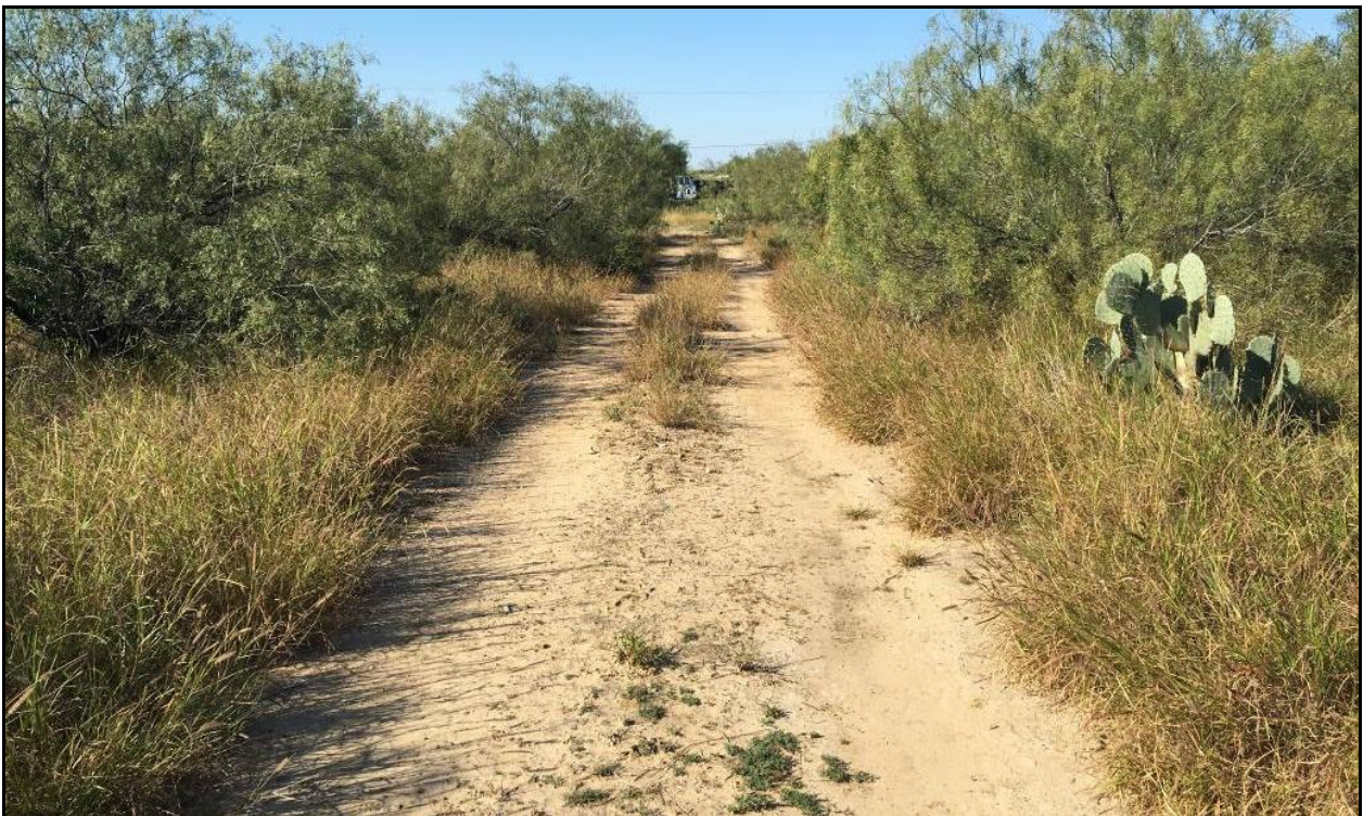
Figure 6-4. View of site 41WB842, facing north