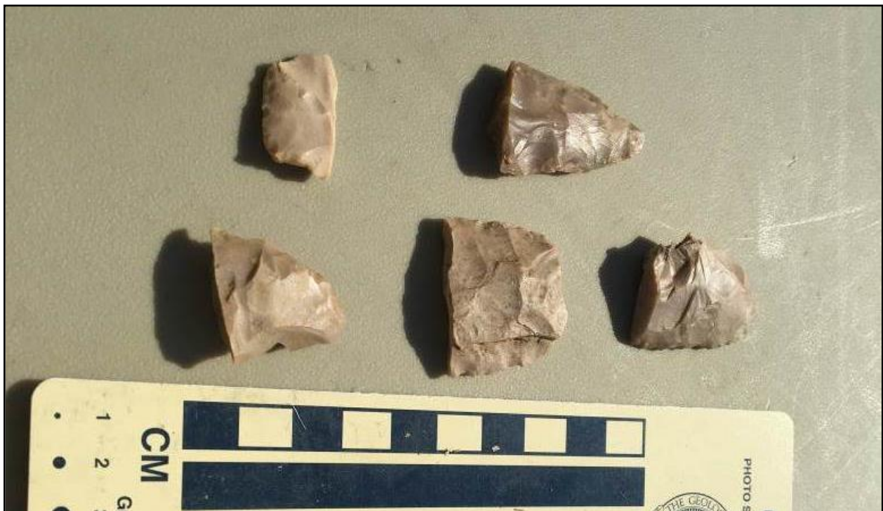
Figure 6-10. Formal tool fragments and bifaces observed on site 41WB842