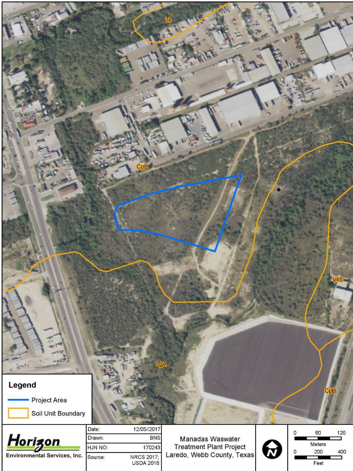
Figure 2-5. Soils mapped within the Project Area