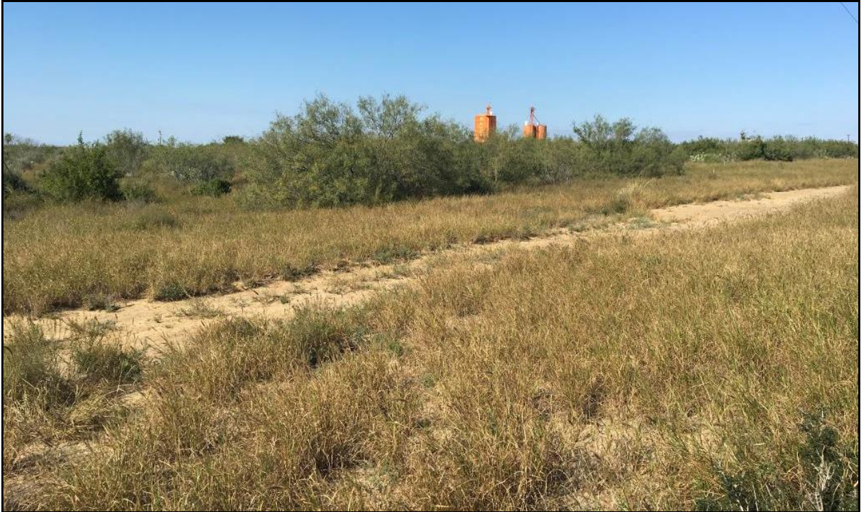
Figure 6-3. View of site 41WB842, facing northwest