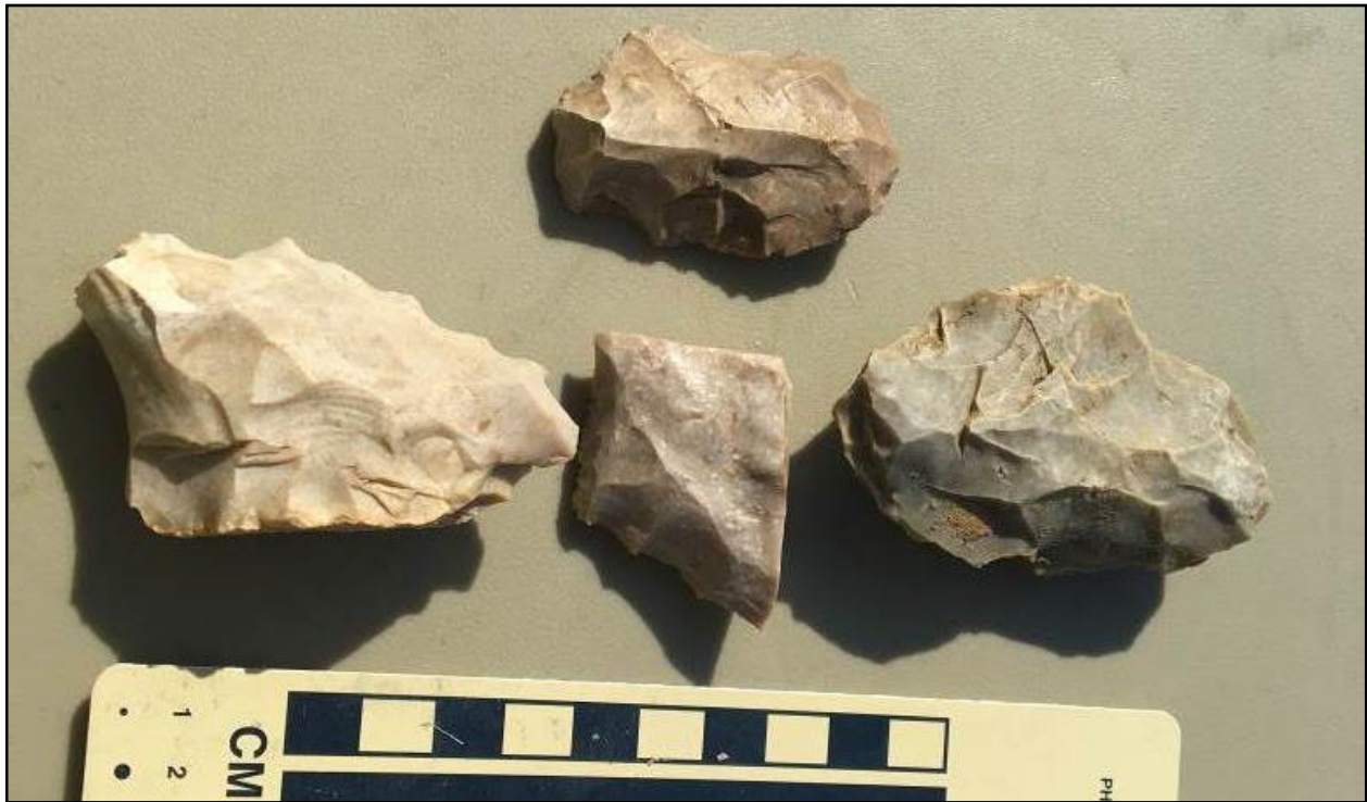
Figure 6-9. Representative bifacially flaked specimens observed on site 41WB842