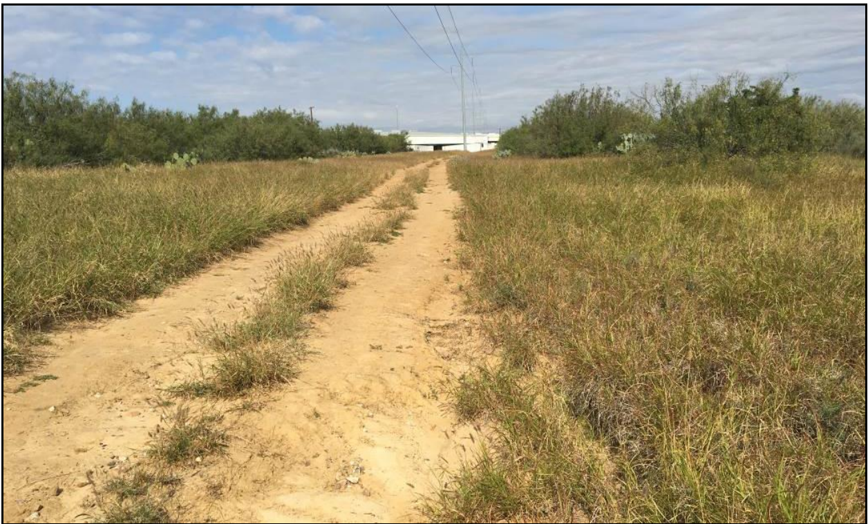
Figure 2-2. General view of Project Area, facing north