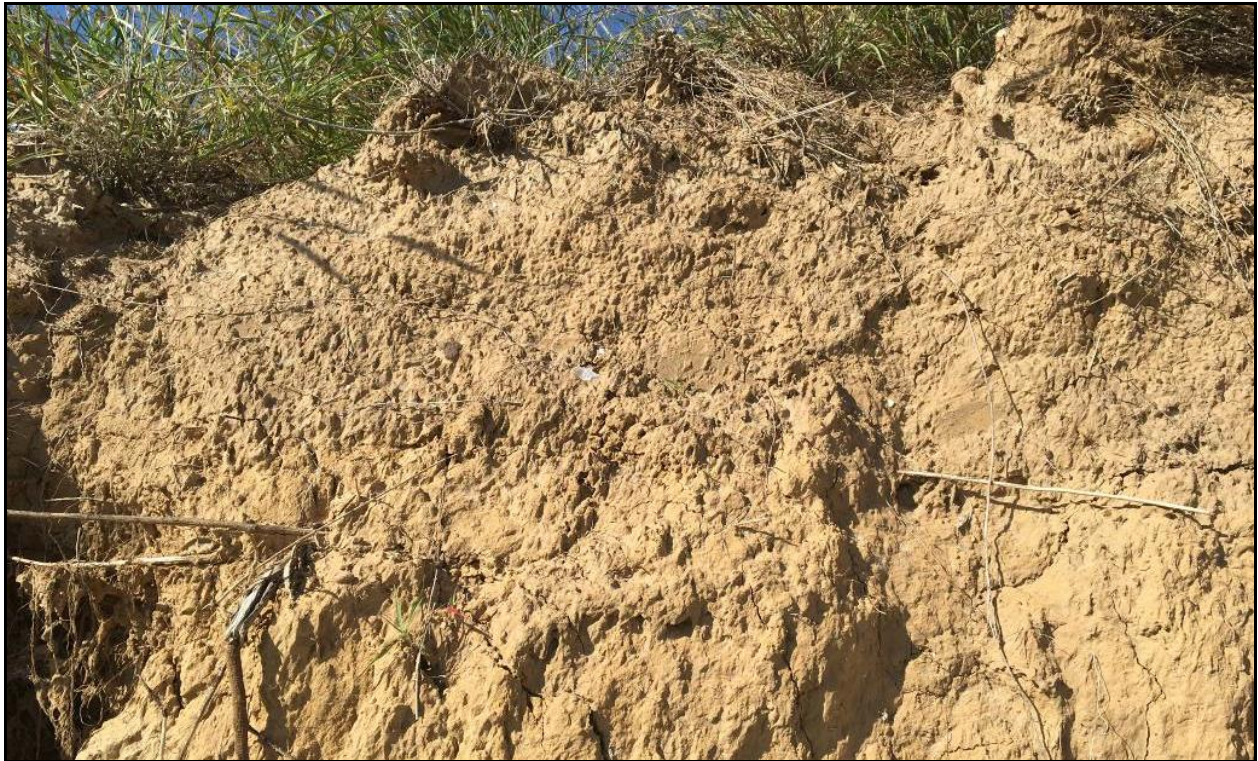
Figure 6-5. Artifacts in wall profile of borrow pit on southeast end of site 41WB842