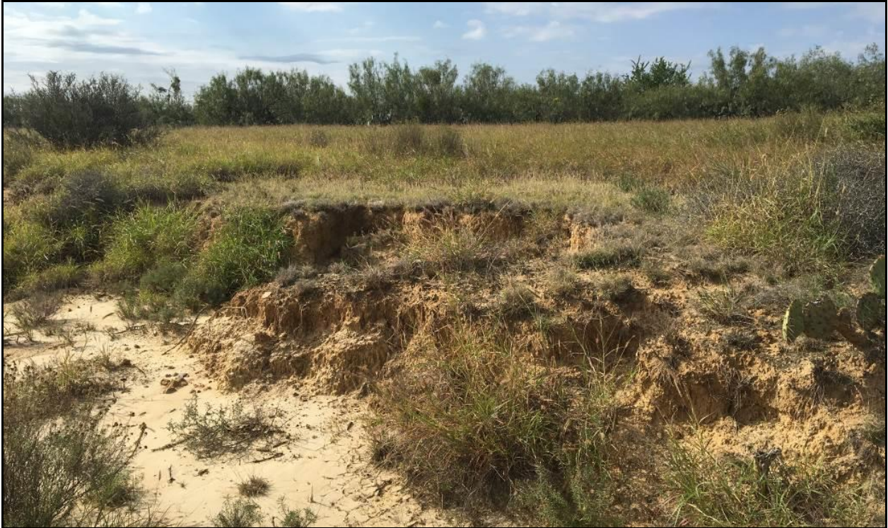
Figure 2-1. General view of Project Area, facing southwest