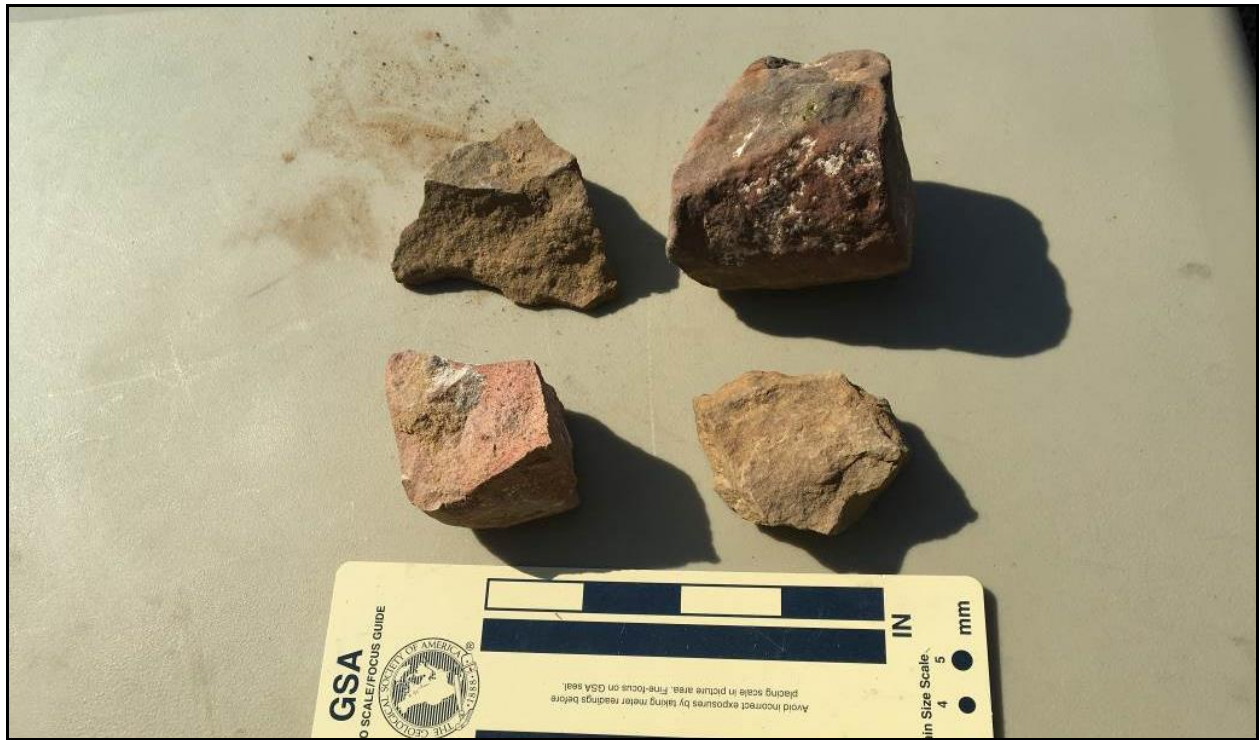
Figure 6-7. FCR specimens observed on site 41WB842