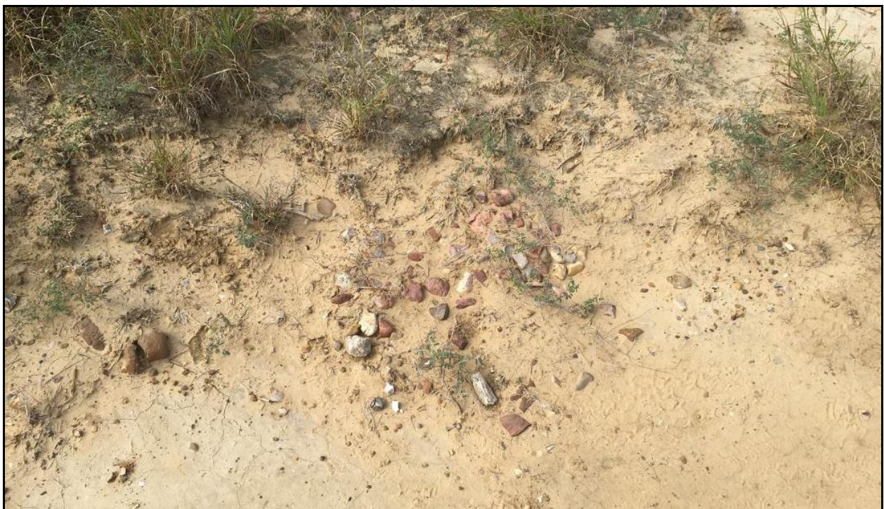
Figure 6-6. FCR feature observed on site 41WB842