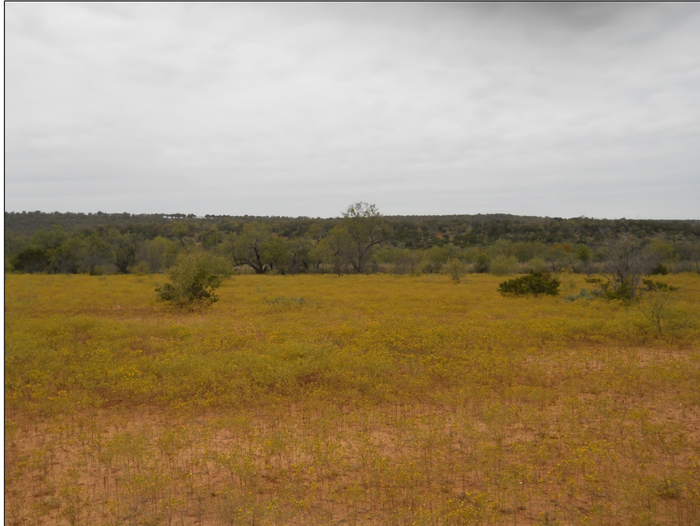
Figure 4-2. Overview of Project Area from Shovel Test 6, Facing North Northwest.