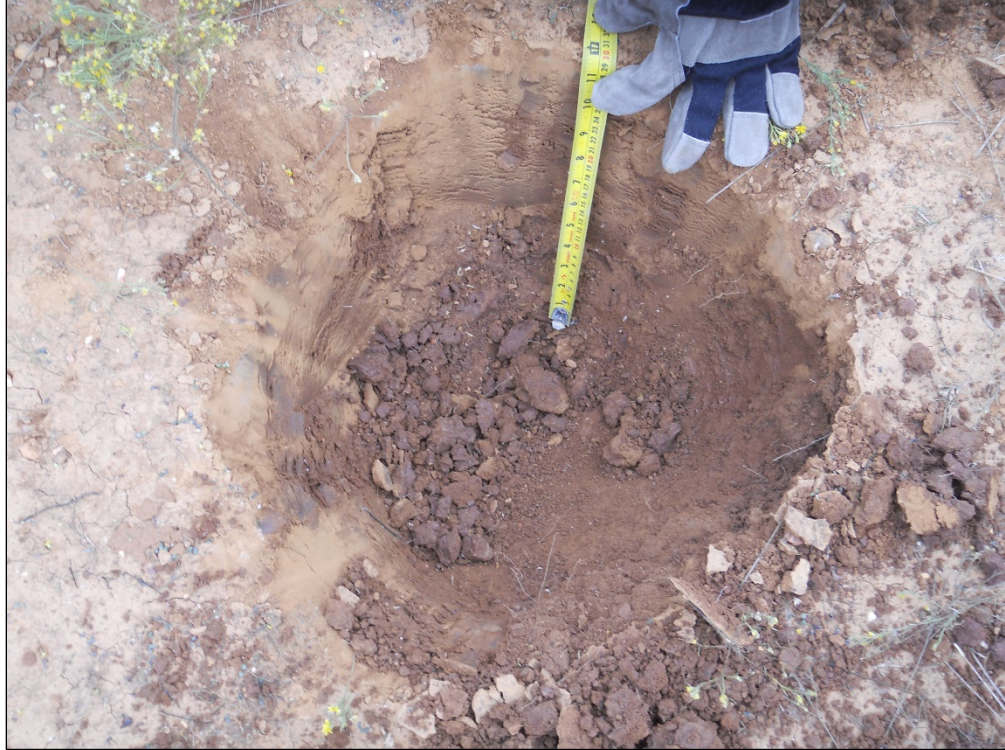
Figure 4-4. Shovel Test 1 Soil Profile.