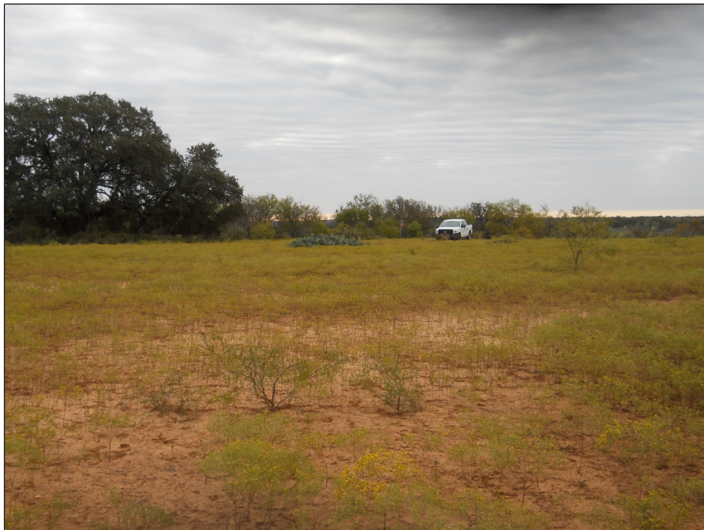
Figure 4-3. Overview of Project Area from Shovel Test 2, Facing Southeast.