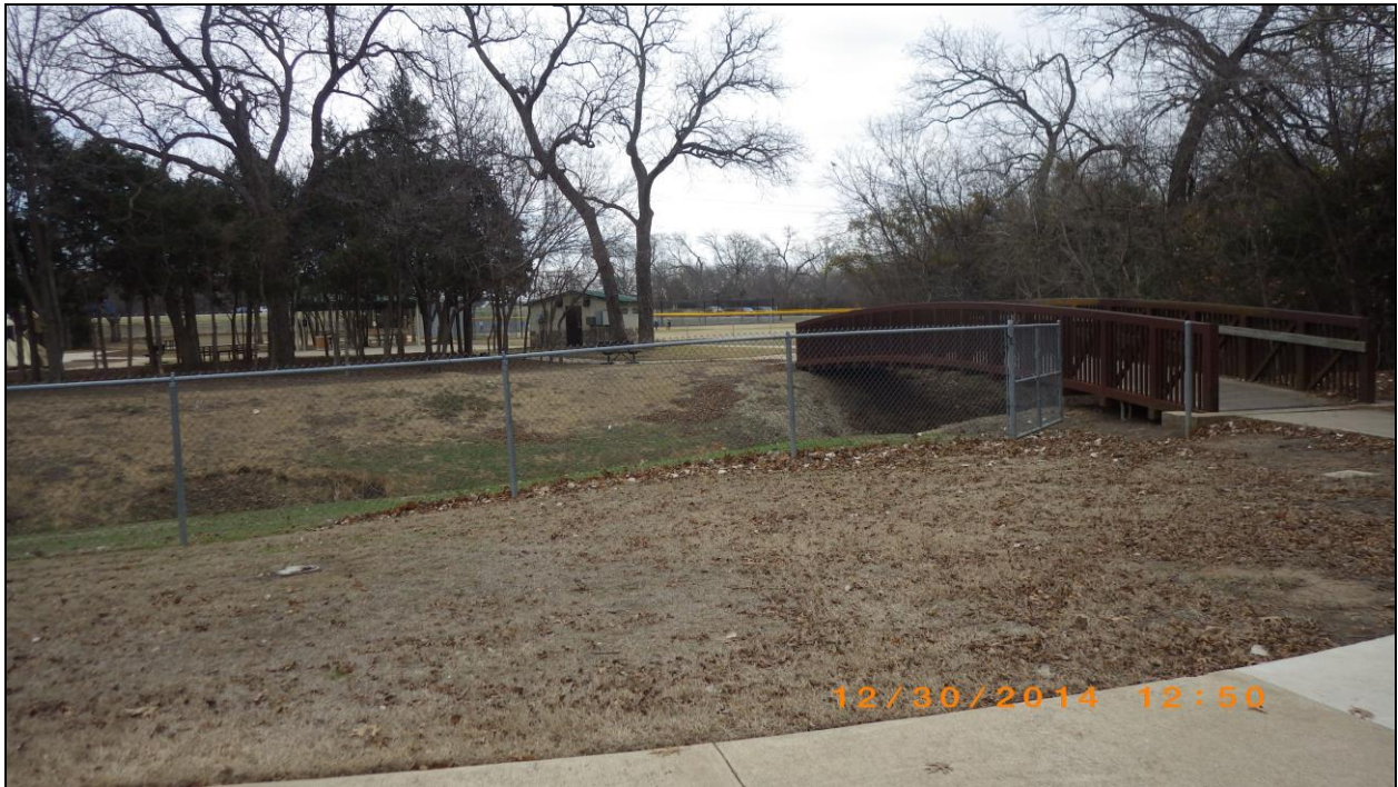
Figure 8. The pipeline route through Bear Creek Park, facing east.

The pipeline route then crosses TX121 and parallels Big Bear Creek and TX360. ST07 and 08 were dug in the small, wooded area between TX 121 and the warehouse complex that was built on site 41TR26. These two shovel tests revealed dark clay on the surface. ST09 and 10 were excavated along the west and south edges of site 41TR26. Both shovel tests exposed various layers of mottled clay with some sand. No evidence of the site was found. ST11 exposed a layer of dark yellowish brown sandy loam above various dark clays, reaching the water table near 60 cmbs. The route then crosses the existing Bear Creek Park including two baseball diamonds, manicured lawns, and a walking bridge (Figure 8). No shovel tests were excavated in this portion of the route because of the existing disturbances or ground visibility greater than 60 percent (Figure 9). ST 12 was excavated just west of where the route crosses TX 360 and where ground visibility and disturbances decreased. It revealed 38 cm of dark yellowish brown sandy loam above black, compact clay. ST13 was excavated on the north side of Big Bear Creek and on the east side of TX 360, showing 80 cm of brown sandy loam.