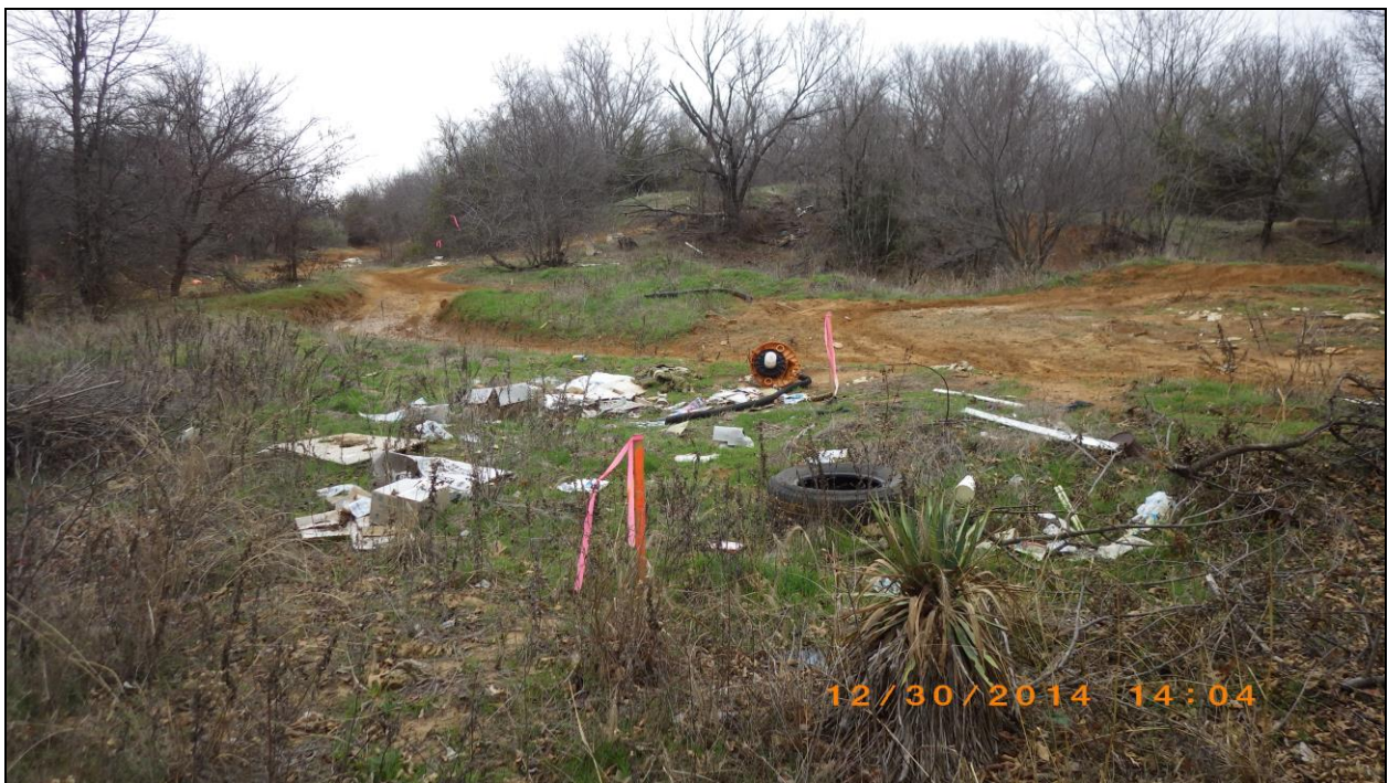
Figure 10. Modern dump area between Big Bear Creek and Euless Grapevine Road, along the edge of site 41TR24.