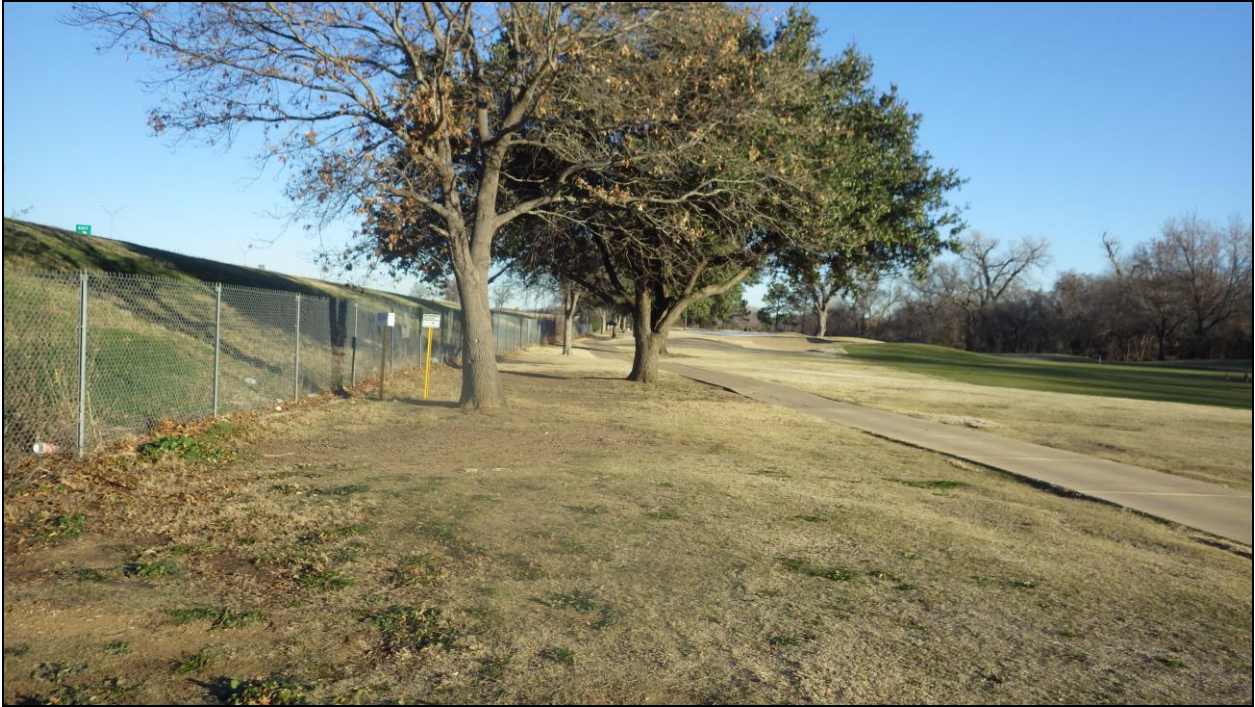
Figure 13. The pipeline route through the Hyatt Bear Creek Golf Course, facing north. The proposed pipeline will run between the fence and the cart path, parallel to existing pipelines.