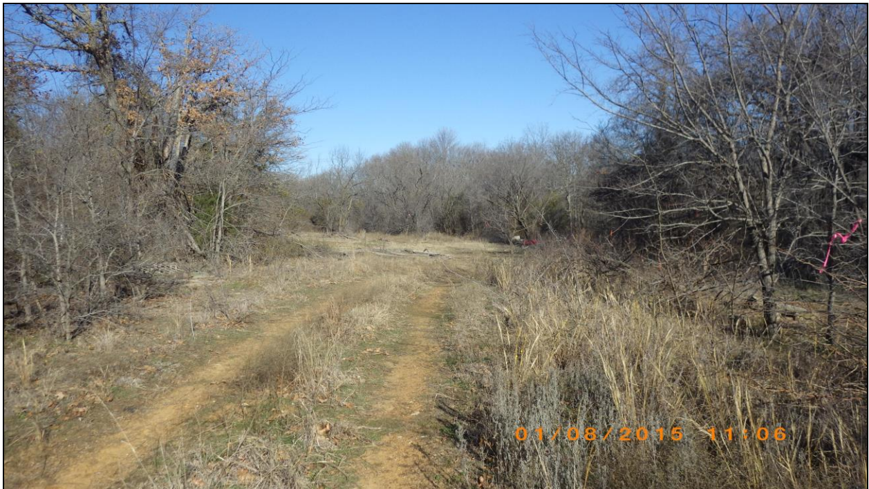
Figure 11. Two-track road that generally parallels the pipeline route between Eules-Grapevine Road and the Hyatt Bear Creek Golf Course, facing west.

Once on the east side of Eules Grapevine Road, the topography and vegetation become more consistent. A two-track road follows the general pipeline route through the wooded, southern portion of the project area between Eules Grapevine Road and the Hyatt Bear Creek Golf Course (Figure 11). Along this rough road there are dozens of small, modern trash dumps that are accompanied by loose piles of sediment indicating further disturbances. This portion of the route also crosses several unmapped intermittent drainages (several of which are lined with concrete at the crossings) that flow into Big Bear Creek (Figure 12). Between Eules Grapevine Road and Glade Road the route mostly crosses the floodplain, but skirts terrace soils as it approaches Glade Road. ST17-37 can be divided into two general types. The first has a loamy upper level and the second has clay throughout. The loamy topsoil ranged in depth from 12-60 cm and in color from yellowish red to dark brown above dark yellowish brown to black clay. The clay topsoil ranged from 14 to 50 cm thick and from dark yellowish brown to black. This clay topsoil overlaid brown to yellowish red clay. No artifacts or features were noted between Eules Grapevine Road and Glade Road.