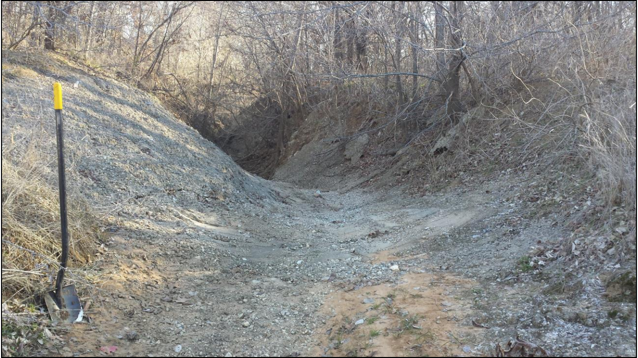
Figure 12. An example of a concrete-lined, unmapped tributary of Big Bear Creek, facing northeast.

The topography and vegetation between Glade Road and the Hyatt Bear Creek Golf Course is similar to that described above, but is mostly on terrace soils, with a small portion crossing the creek's floodplain. ST38-54 were excavated along this portion of the route and either had loamy or clay topsoil. The shovel tests with loamy upper layers reached up to 80 cmbs and ranged in color from strong brown to very dark grayish brown. The thinnest topsoil layers were found in terrace and upland settings. Shovel tests with clay upper levels were 15-50 cm thick and ranged in color from dark yellowish brown to very dark grayish brown and were sitting atop yellowish brown to very dark gray clay subsoil.