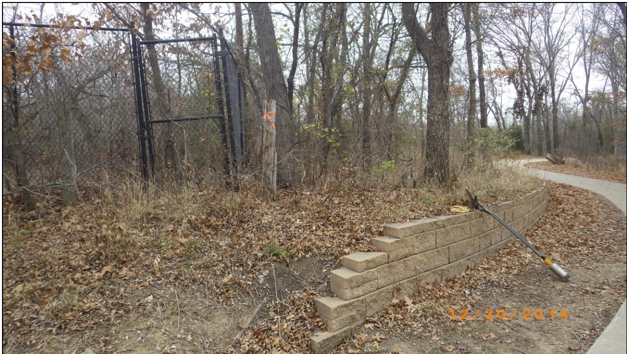
Figure 2. The pipeline route through Parr Park, facing east.

The vegetation in the wooded portions of the route are dominated by hackberry, oak, juniper, and pecan trees along with grasses, greenbrier, and other vines. Generally, the ground visibility in these areas is zero percent due to the grasses and fallen leaves. Exceptions are described below. In total, 56 shovel tests (ST) were excavated in areas with less than 30-percent ground visibility and areas that were relatively undisturbed (Figures 3-7). The northern end of the route is in Parr Park and runs between a housing development and a hike/bike trail (Figure 2). Six shovel tests were excavated in this section of the route (Figure 3 and Table 1). ST01, 02, and 04 revealed thick deposits (110-135 cm) of silty sand and sandy loam, whereas ST05 and 06 reached very dark grayish brown to dark brown mottled clay anywhere from 50-90 cm below the surface (cmbs). No artifacts were found in this portion of the route. The route then passes through Wall-Farrar Nature Park, which was surveyed by ARC in February 2014 (Hall 2014). No cultural resources were identified during this recent survey.