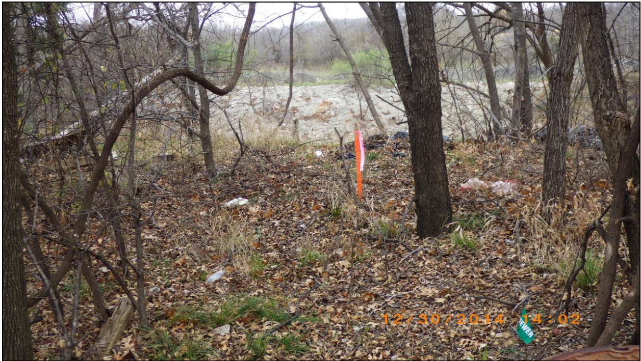
Figure 9. Typical combination of vegetation and disturbance in the northern portion of the project area, facing east.