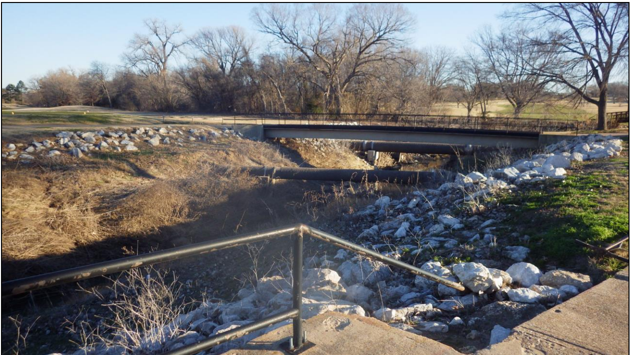
Figure 14. Little Bear Creek just upstream from its confluence with Big Bear Creek, facing northwest.