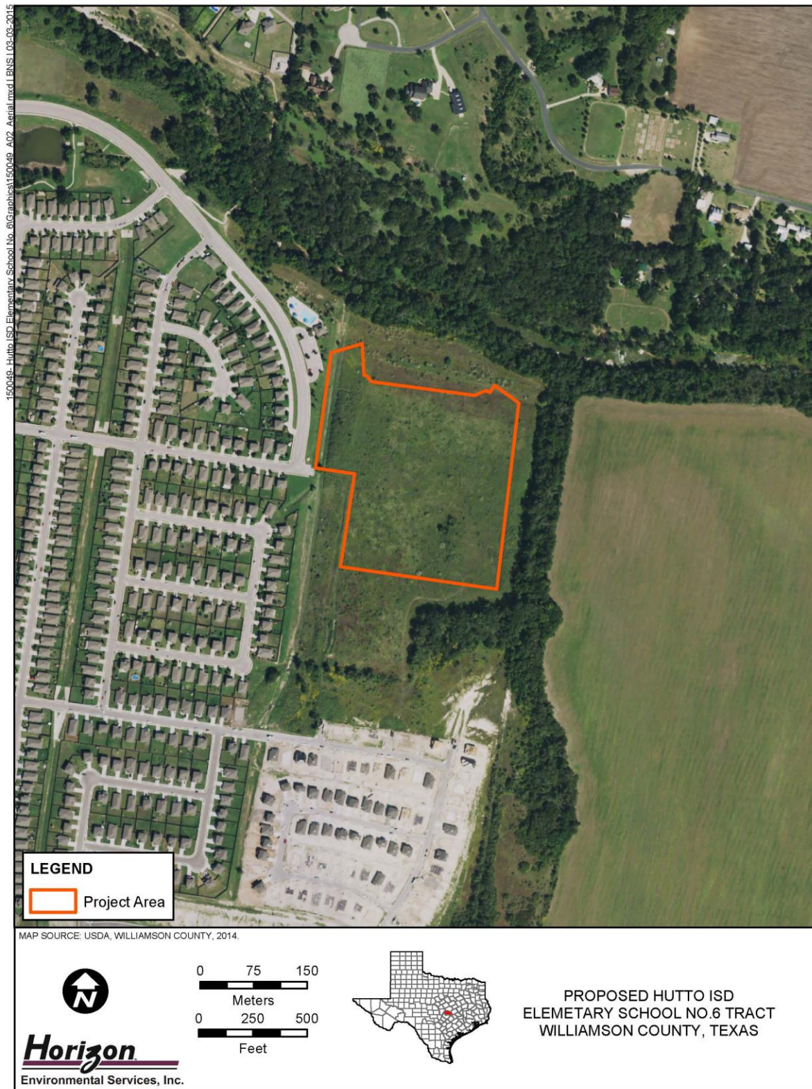
Figure 2. Location of Project Area on Aerial Photograph