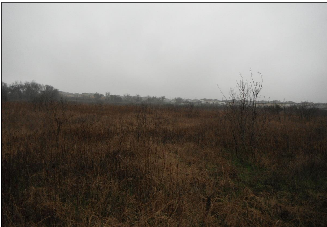
Figure 6. Overview of Project Area from Northern Boundary (Facing South)