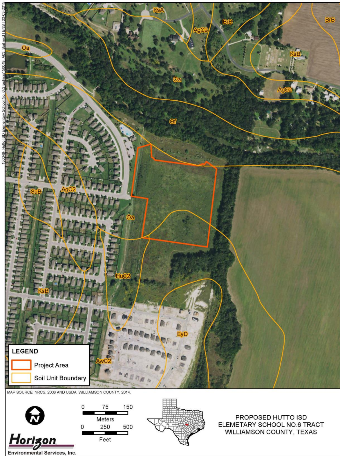
Figure 3. Distribution of Soils Mapped within Project Area