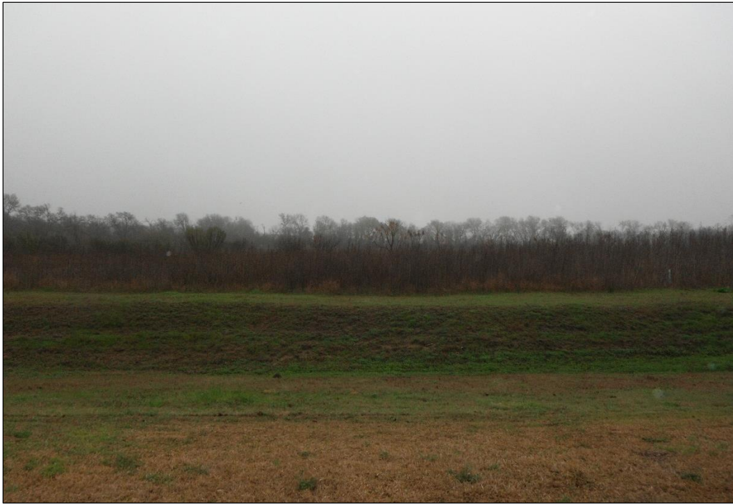
Figure 5. Overview of Project Area from Western Boundary (Facing East)