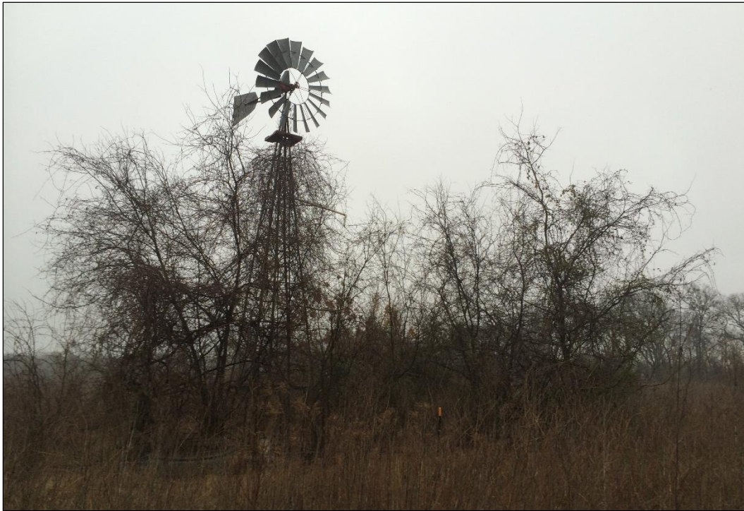
Figure 7. Windmill in Southeastern Portion of Project Area (Facing North-Northeast)