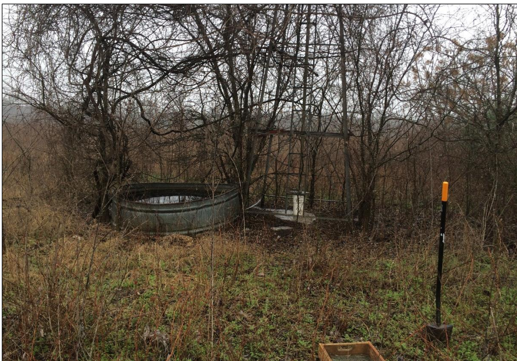
Figure 8. Stock Tank at Base of Windmill (Facing North)