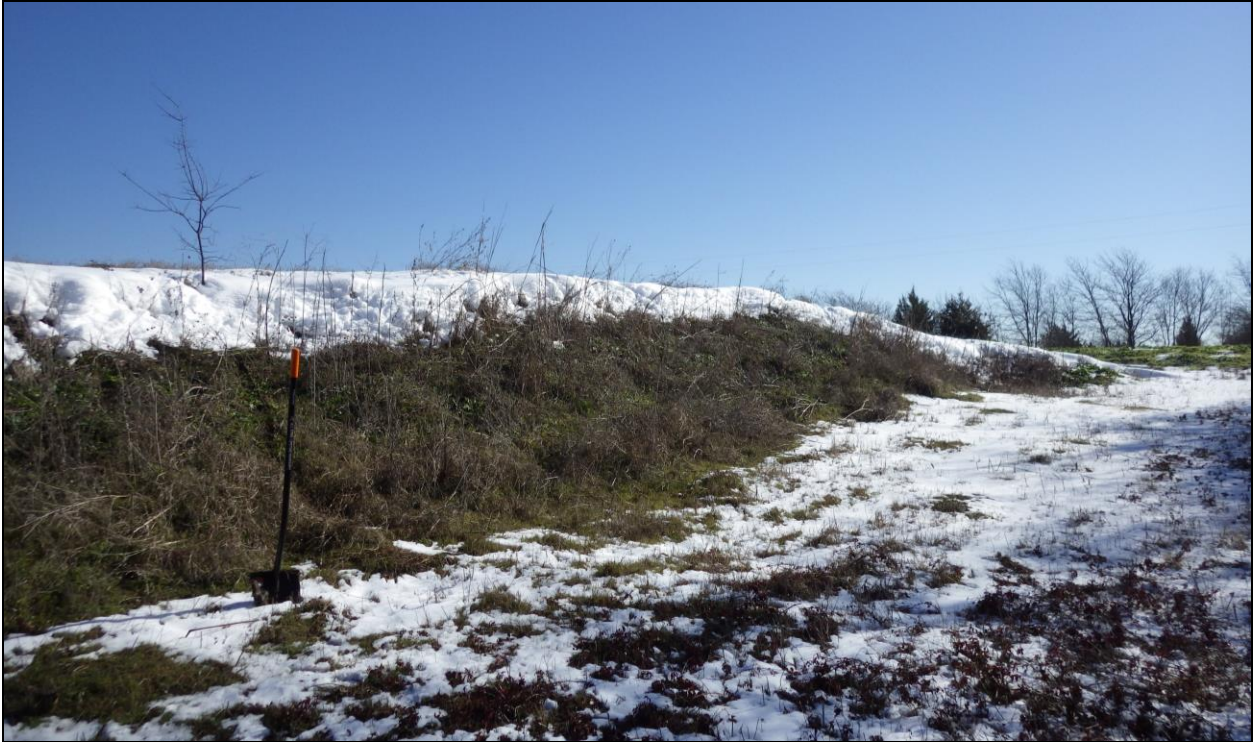
Figure 6. The built-up portion of the property, just north of ST05, facing northeast.