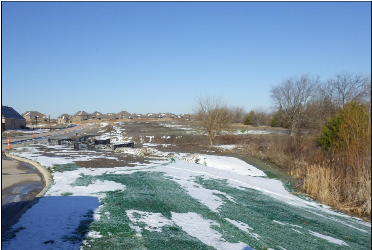
Figure 2. The southern edge of the Stone Creek Park property, facing west. Note the scraped field in the background.

The southwest portion of the project area is a plowed field that was recently scraped by a developer, leaving 100-percent ground visibility at the time of survey (Figure 2 and Figure 3). The rest of the property was covered in one- to three-foot-tall grasses with scattered trees (Figure 4 and Figure 5). Bois d'arc, oak, and juniper trees were concentrated along the creek, the pond edge, and fence lines. The north half of the western portion was terraced when it was being farmed. Part of the property located along John King Boulevard and just north of shovel test (ST) 05, has been built up to create a level surface 3-6 feet above the natural surface (Figure 3 and Figure 6). No shovel tests were excavated on this raised portion. The narrow stream floodplain is covered with short grasses and a few scattered trees (Figure 7).