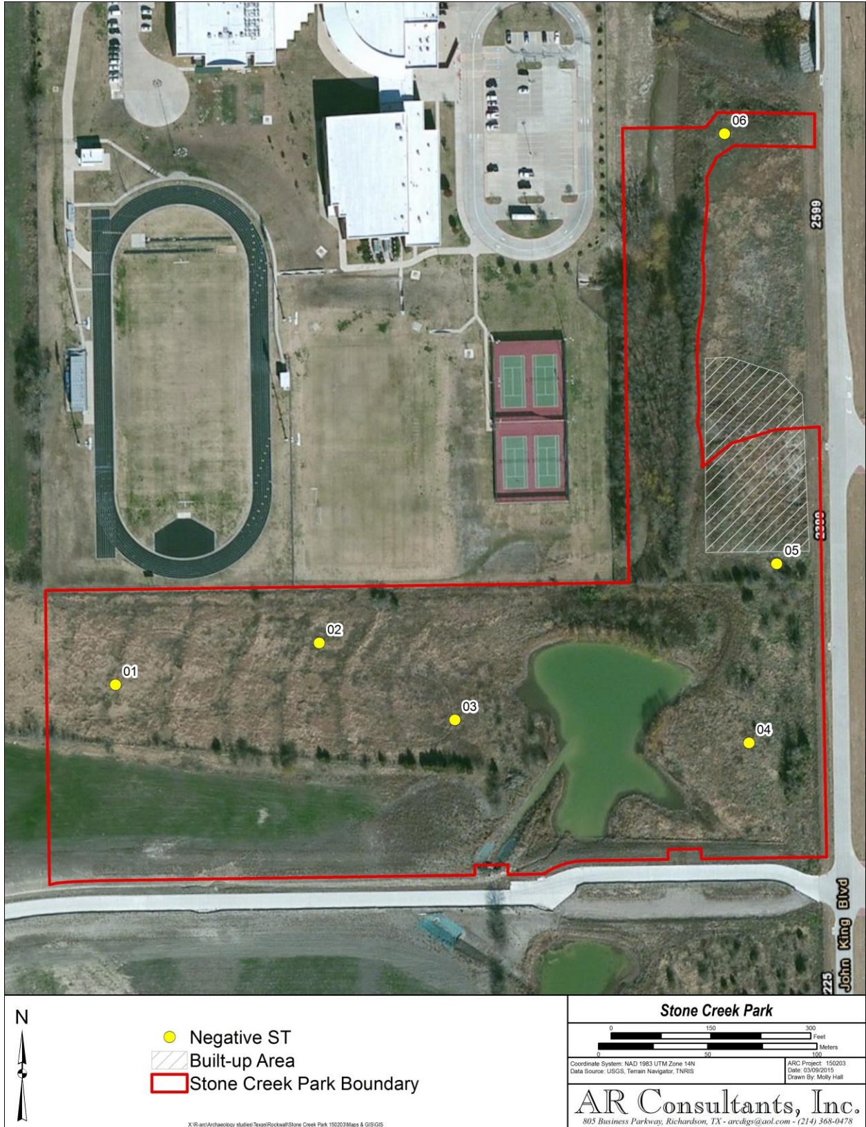
Figure 3. The proposed Stone Creek Park and shovel test locations shown on a recent aerial photograph.