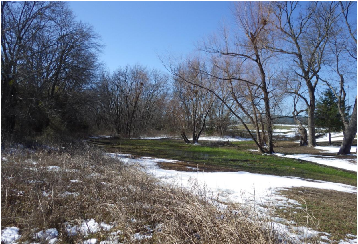
Figure 7. The stream corridor, facing south from the north end.