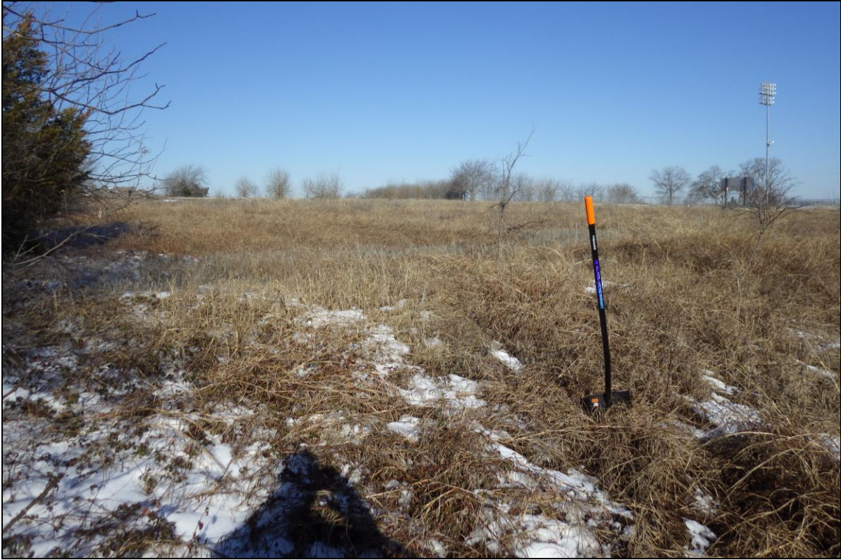
Figure 4. The terraced field south of the school property, facing west-northwest.