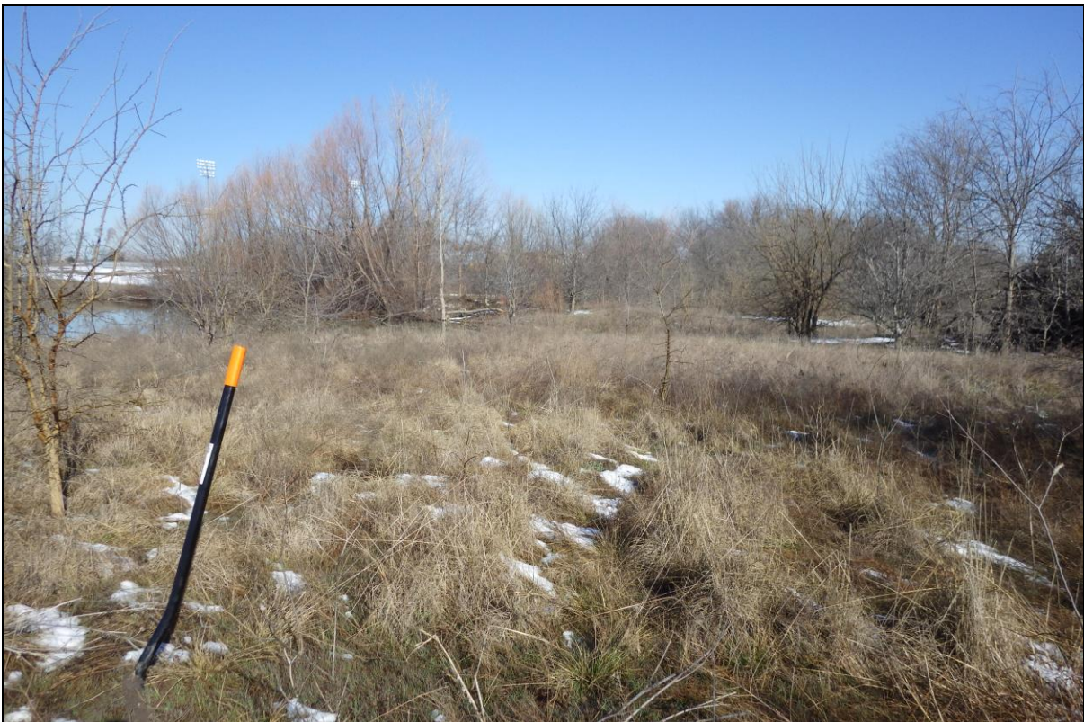
Figure 5. The property east of the pond, facing north-northwest.