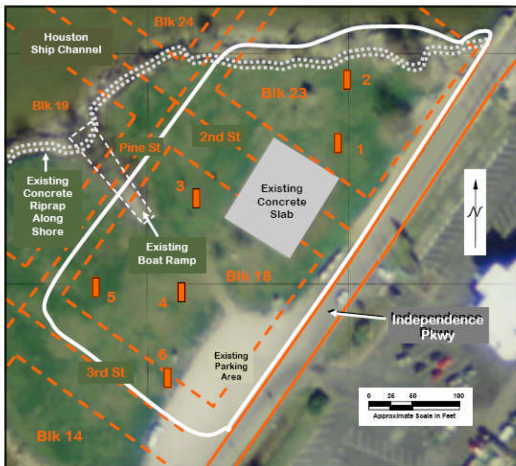
Figure 5. Aerial overlay of project area (within bold white border) with estimated locations of the blocks of historic San Jacinto townsite indicated by orange dashed lines and approximate backhoe trench locations indicated by numbered orange rectangles.

The trenches (Figure 5) were dug in approximate 20-centimeter-thick unit levels (scraps) using a flat-bladed bucket about three feet wide.