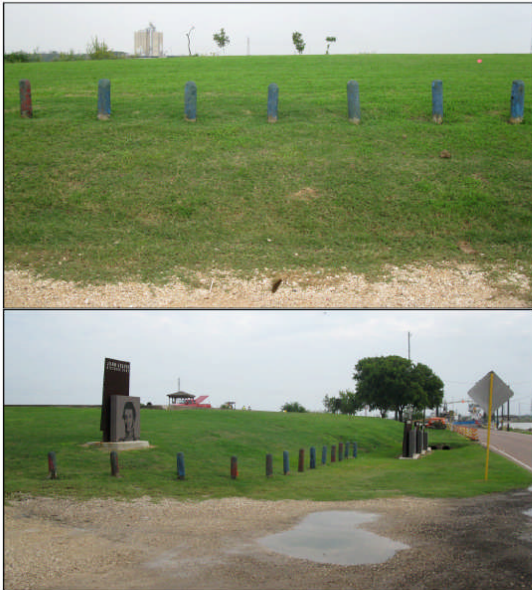
Figure 4. Two photographs of project area taken by the Principal Investigator during fieldwork.

concrete slabs, the entire project area was overgrown in short grass that was being mowed regularly by Harris County (Figure 4).