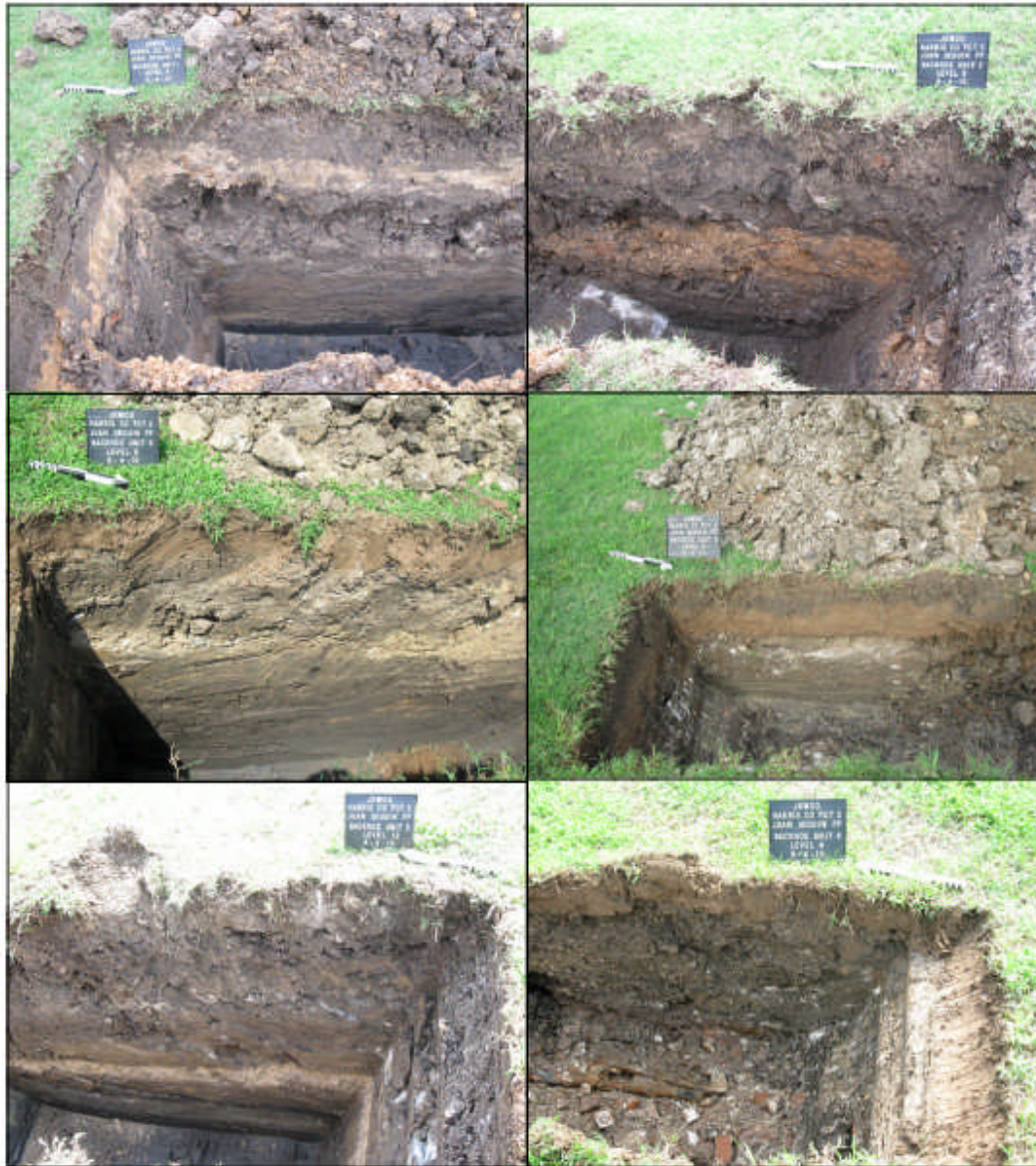
Figure 3. Partial profiles of six archeological backhoe tests showing basic stratigraphy of mixed artificial fill over dense clay.

On September 4, 2010, JKWCO performed visual surface inspection of the area of potential effects to archeological resources for the project (the entire project area) and excavated six archeological backhoe test units distributed across the area (Figure 3).