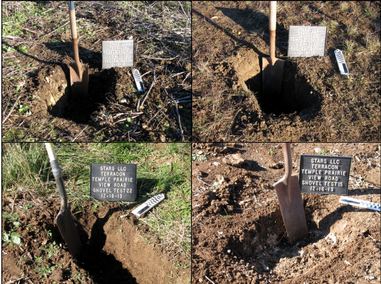
Figure 4. STARS shovel tests in progress. Clockwise from top left: Shovel Tests 1, 4, 15, and 22. Approximate locations of tests are shown in Figure 2.

evidence. Most of the shovel tests were able to be excavated to depths between 40 and 60 cm below the surface, and most were dug to bedrock or impenetrable gravels. In a few areas shallow soils prevented excavations below about 15-20 cm beneath the surface. The soil encountered throughout the excavated columns of most of the tests was gray-brown (about 10YR4/3 Munsell value) or dark gray-brown (about 10YR3/1 Munsell value) loamy or gravelly clay (Figure 4).