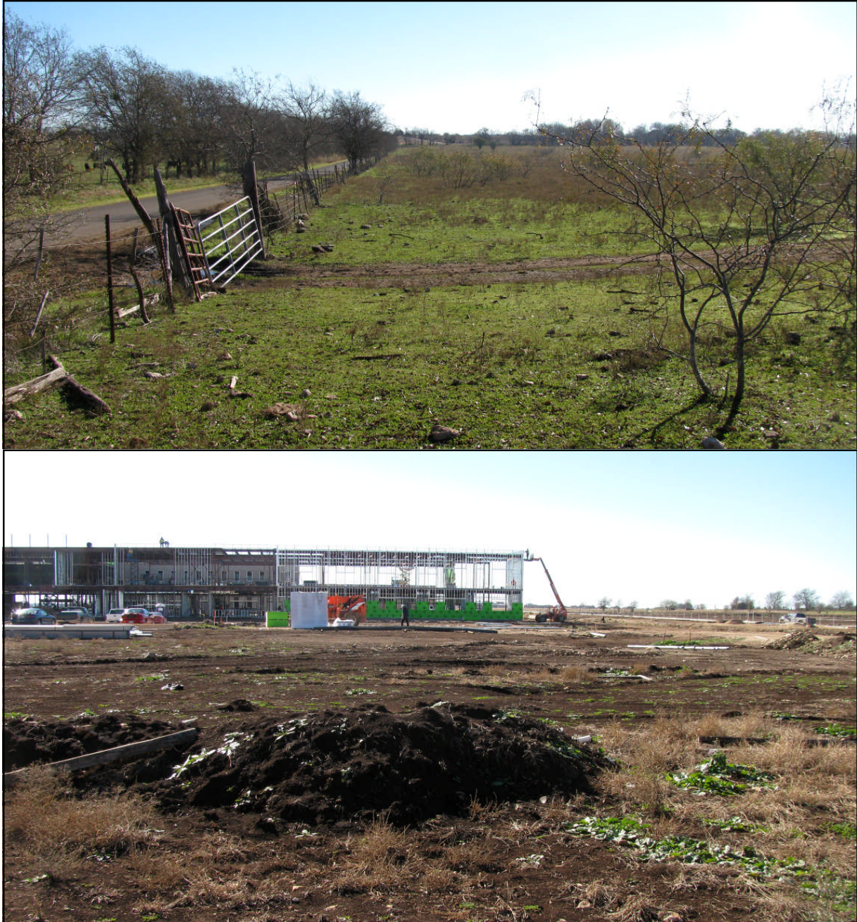
Figure 3. Two photographs of the APE taken during STARS fieldwork. Top: Sweeping view to east from near Shovel Test 11, with Prairie View Road at left. Bottom: View to south from near Shovel Test 15, showing active disturbances from industrial construction.