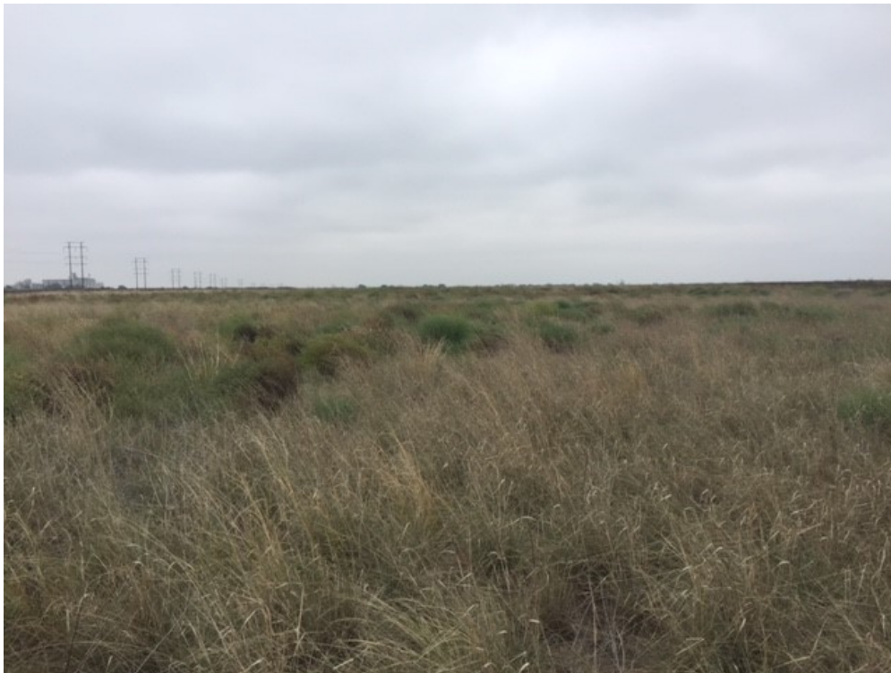
Figure 2. View from western end of APE toward center of APE showing typical vegetation across the APE; facing east.