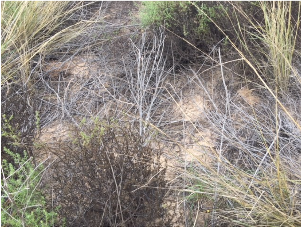
Figure 3. View of typical ground surface visibility.