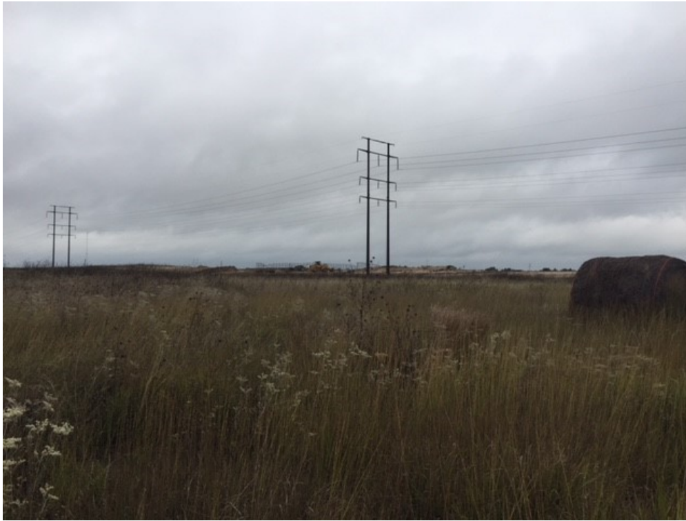
Figure 1. View from shovel test HR13 toward existing landfill, showing hay bale at right; facing northwest.