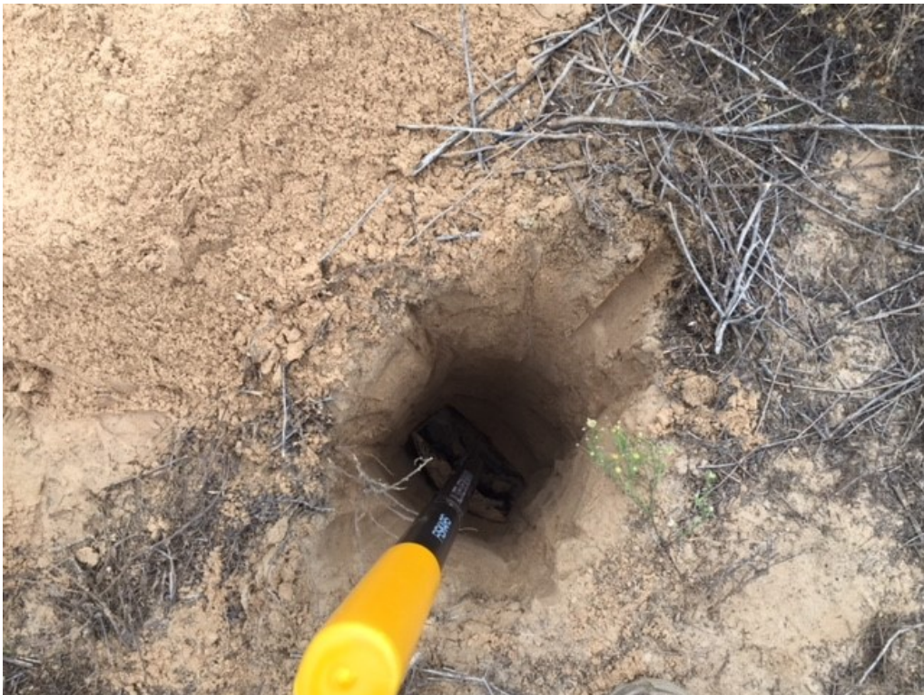
Figure 4. View of shovel test HR05.