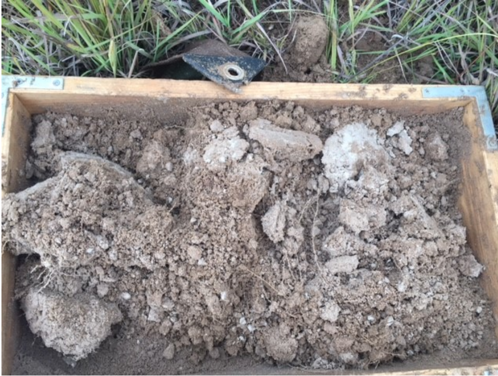
Figure 5. View of calcium carbonate from shovel test HR13.