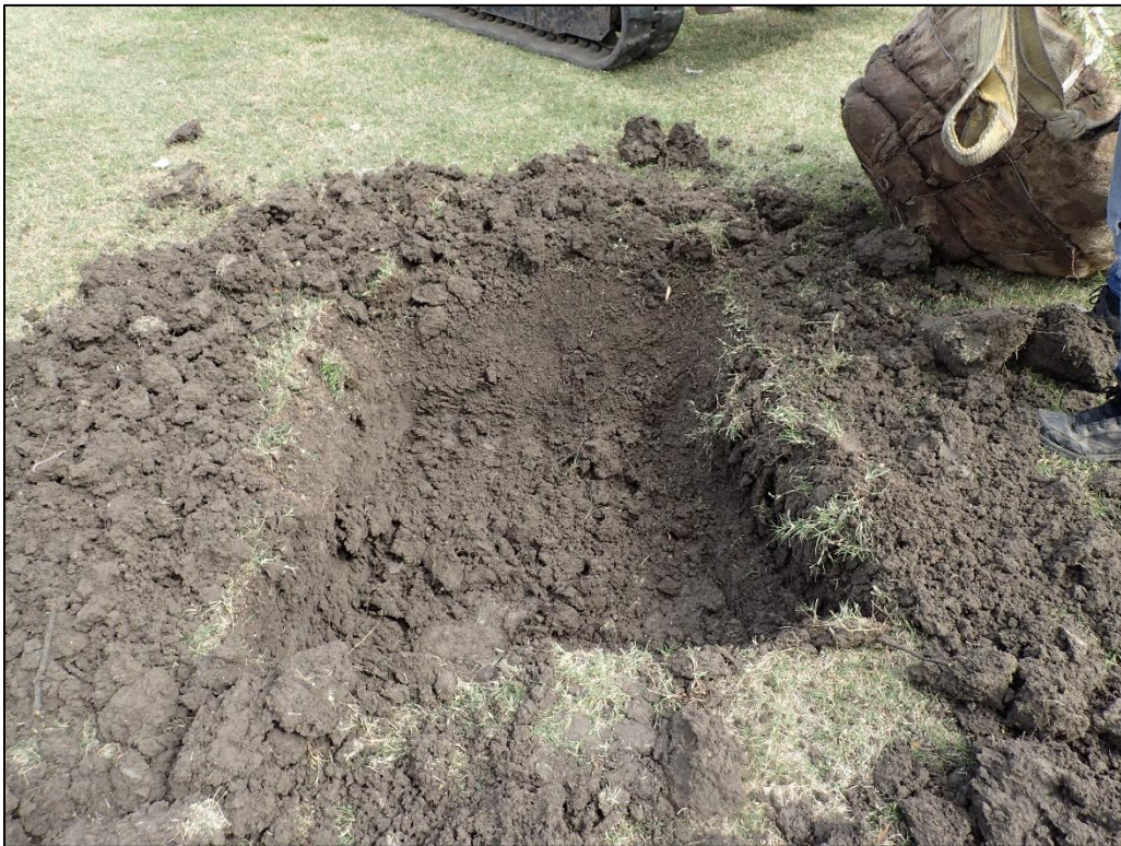
Figure 7. Tree Pit 32, camera facing northeast