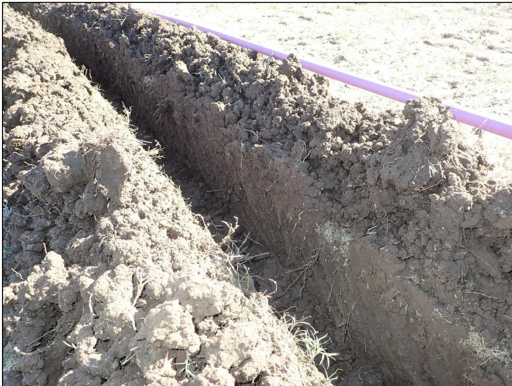
Figure 17. Irrigation Line within 41BX1800, camera facing southwest

Site 41BX1800 was revisited by Pape-Dawson archaeologists during the course of the current project. Archaeologists monitored the excavation and planting of 16 trees and the installation of approximately 146 m of irrigation line within and adjacent to the 41BX1800 site boundary (Figure 16). The dimensions of the tree pits varied based on the size of each trees root system. On average, holes measured 110 cm 2 in diameter and had depths that ranged from between 41-53 cmbs. Irrigation trenches were approximately 25 cm wide and were excavated to a depth of between 27-28 cmbs (Figure 17). Soils encountered while monitoring tree planting and irrigation trench excavation were typically either a loamy clay or sandy clay loam that was a very dark brown to dark yellowish-brown color. No indications of soil disturbance were noted during the monitoring of excavations within the site.