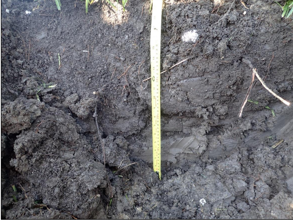
Figure 9. Tree Pit 173 Profile, camera facing east