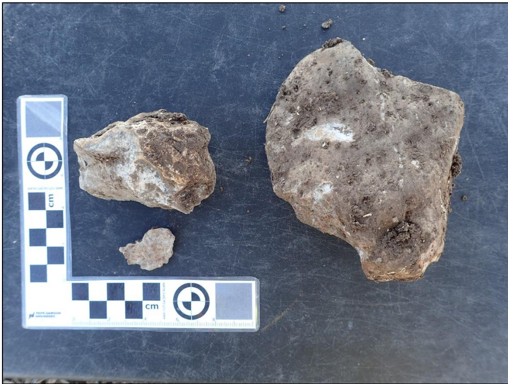
Figure 18. Artifacts observed within irrigation line