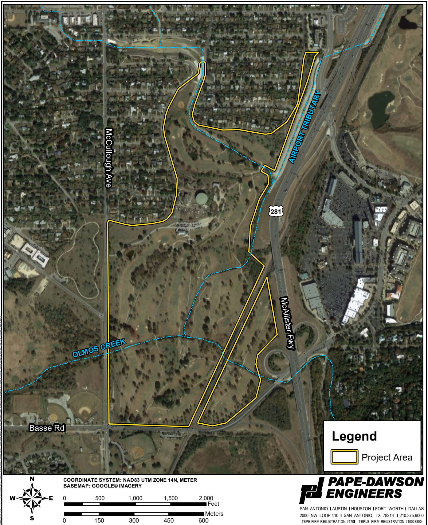
Figure 2. Project Area Map