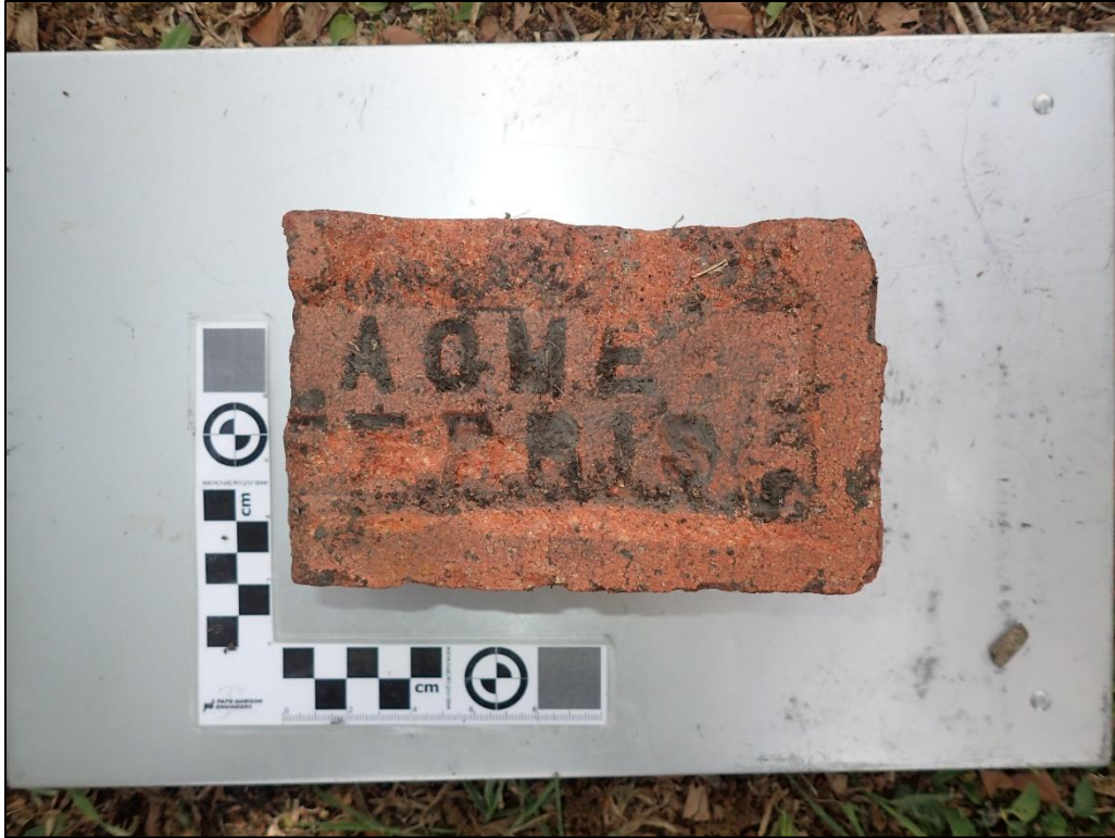
Figure 14. Stamped Brick observed within Irrigation Line