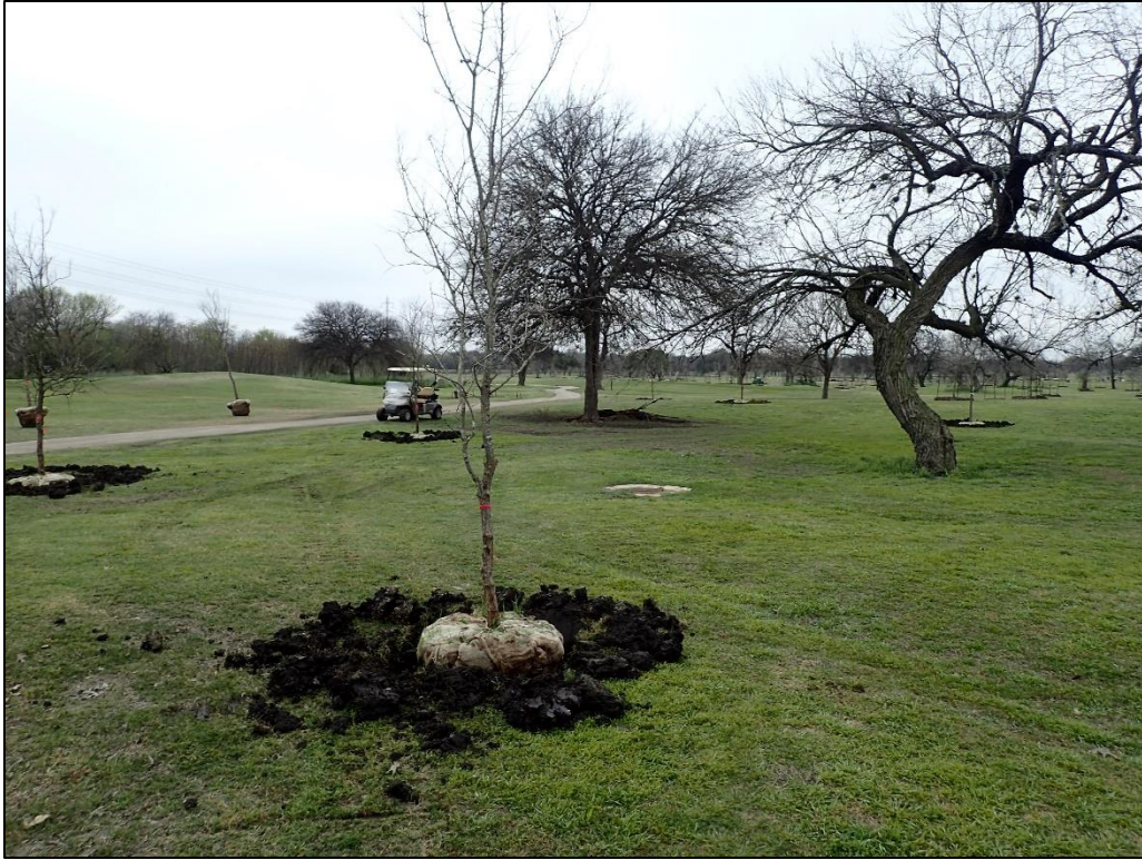
Figure 6. Project Area Overview from Tree Pit 21, camera facing south