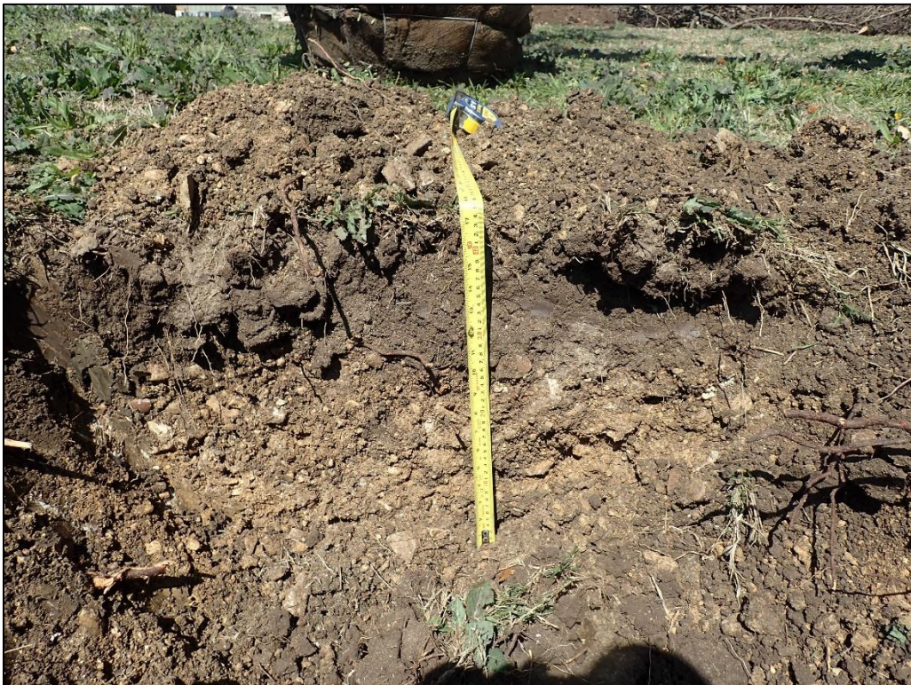
Figure 10. Tree Pit 76 profile, disturbed, camera facing west