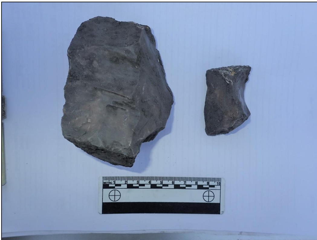
Figure 13. Chert shatter observed within irrigation line

Artifacts were also documented within irrigation trenches throughout the site. Prehistoric artifacts observed included 2 tested chert cobbles, 2 chert multidirectional core fragments, 1 piece of chert primary debitage, 1 piece of chert secondary debitage, 5 pieces of chert angular shatter debitage, and 13 pieces of chert FCR. Historic artifacts included 2 historic red brick fragments, 1 yellow brick fragment, 1 ceramic tile sherd, 3 colorless glass shards, 5 amber glass shards, 1 Coke bottle green glass shard, 1 aluminum can pull tab, 1 aluminum beer can fragment, 1 wire reinforced concrete fragment, 2 concrete fragments, 1 asphalt fragment, and approximately 10 plastic fragments. One red brick fragment was stamped “ACME FERRIS” and research indicated it was manufactured sometime between 1935 and 1969 (Beck 2016) (Figure 14). The precise depths at which the artifacts were recovered were unable to be determined as they were unearthed by a trenching machine, used for irrigation trench excavation, which excavates and jumbles large amounts of soil at a high rate of speed.