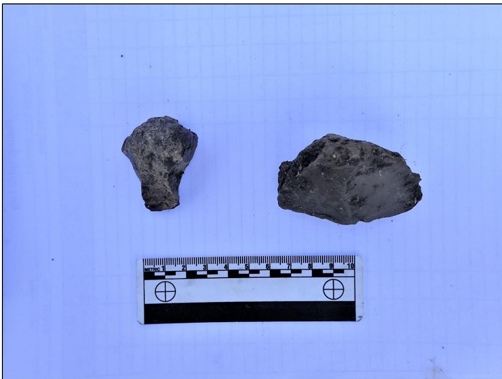
Figure 12. Two pieces of chert FCR recovered 30-40 cmbs from Tree Pit 179

Of the 191 tree planting locations monitored within and adjacent to the site 41BX1799, 11 contained intact, undisturbed soils that were positive for cultural materials. Prehistoric and historic artifacts were observed in the 11 intact soil tree pits. Observed prehistoric artifacts from these deposits included 1 lithic core fragment and 8 pieces of lithic chert FCR. Historic artifacts consisted of 2 aluminum can pull tabs, 1 rebar segment, 1 cement fragment, and 3 plastic fragments. A total of 57 of the 191 tree pits contained some level of disturbance, resulting from the construction and maintenance of the golf course. Of the 57 disturbed tree pits, 9 were positive for cultural material. Observed prehistoric from the disturbed context included 1 piece of chert secondary debitage and 2 pieces of chert FCR. Historic artifacts consisted of 1 historic ceramic vessel body sherd (unglazed earthenware), 1 aluminum can pull tab, 1 rebar segment, 2 asphalt fragments, 2 concrete fragments, 1 cement fragment, and 3 plastic fragments. No diagnostic prehistoric artifacts were observed during tree pit excavation of site 41BX1799. Non-diagnostic artifacts were noted during tree pit excavation at depths ranging from between 0 to 50 cmbs (Figure 12).