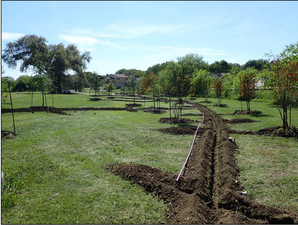
Figure 8. Overview of Irrigation Lines within 41BX1799, camera facing southwest