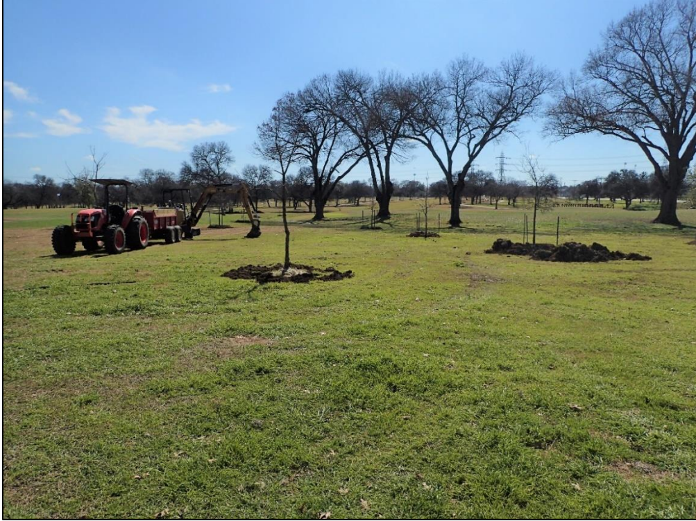
Figure 15. Overview of 41BX1800, camera facing north