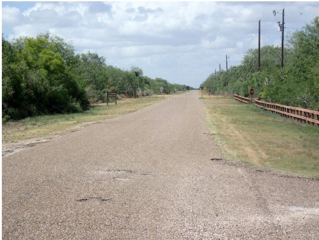
Figure 4-20. HR-01, Buena Vista Road, facing south from Lakeside Drive

HR-01, Buena Vista Road is indicated on maps as early as 1929, though at that time it was not yet paved (USGS 1929). By 1955, Buena Vista Road had been paved and is shown on maps as a medium-duty road. A medium-duty road indicated that it was paved, and at least twenty-two feet in width to permit passage of vehicles in both directions. Currently, the road is paved with asphalt approximately 23 feet in width without lane markings (Figure 4-20 through Figure 4-23). The ROW is approximately 23 feet from the edge of the roadway. At the time of the field survey, Buena Vista Road was being realigned at the south end of the project area, as the intersection with General Brant Road (FM 106) is being redesigned (see Figure 4-21).