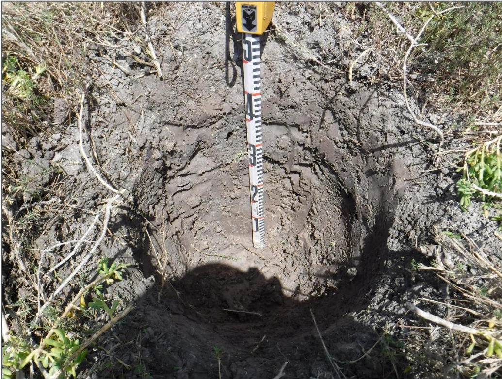
Figure 4-14. Disturbed shovel test profile showing abundant calcium carbonate just below the ground surface, facing down