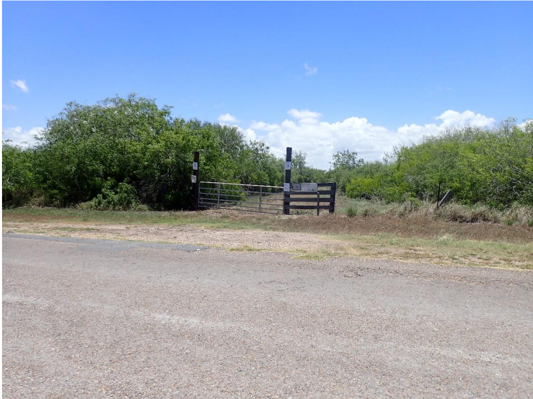
Figure 4-25. HR-03, gate on unpaved refuge access road to bayside section, facing northeast