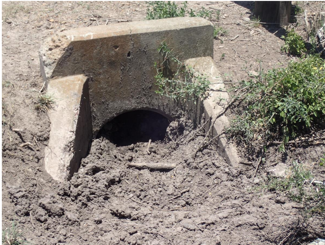
Figure 4-26. HR-04, culvert, south side of culvert, facing north

There are three culverts located in the APE which appear to be of approximately the same age, c. early 1950s. HR-04 is located about 10 feet west of HR-03, approximately 0.84 miles south of the intersection with Lakeside Drive that marks the northern end of the APE. HR-05 is located approximately 0.8 mile south of the intersection with Lakeside Drive. HR-06 is located approximately 0.7 mile north of the intersection with General Brant Road. None of the culverts have stamping or other markings to indicate when the road improvements were undertaken. HR-04 (Figure 4-26 and Figure 4-27) was likely built when the access road off Buena Vista Road was constructed in the early 1950s. Based on similar design, form, and wear, HR-05 (Figure 4-28 and Figure 4-29) and HR-06 (Figure 4-30 and Figure 4-31) were likely installed at the same time as HR-04. All three resources are concrete pipe culverts with a chamfered headwall and wingwalls.