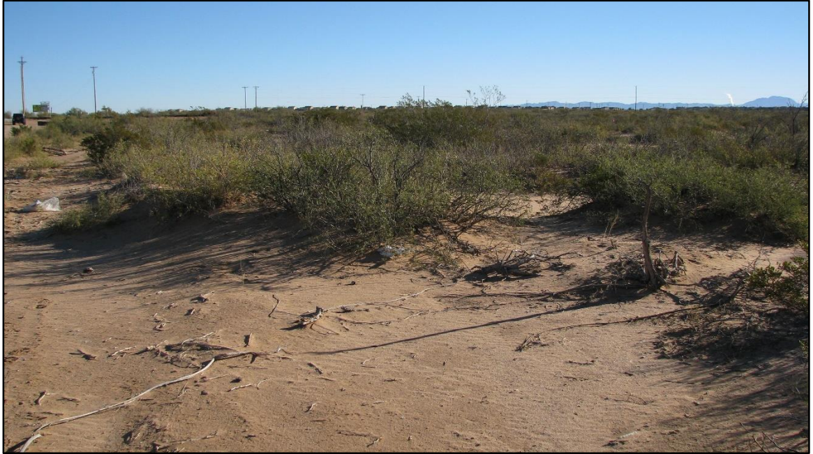
Figure 4-2. Survey parcel looking northeast along U.S. Highway 54.