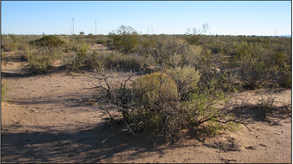
Figure 4-4. Eastern portion of the parcel, looking north-northeast.