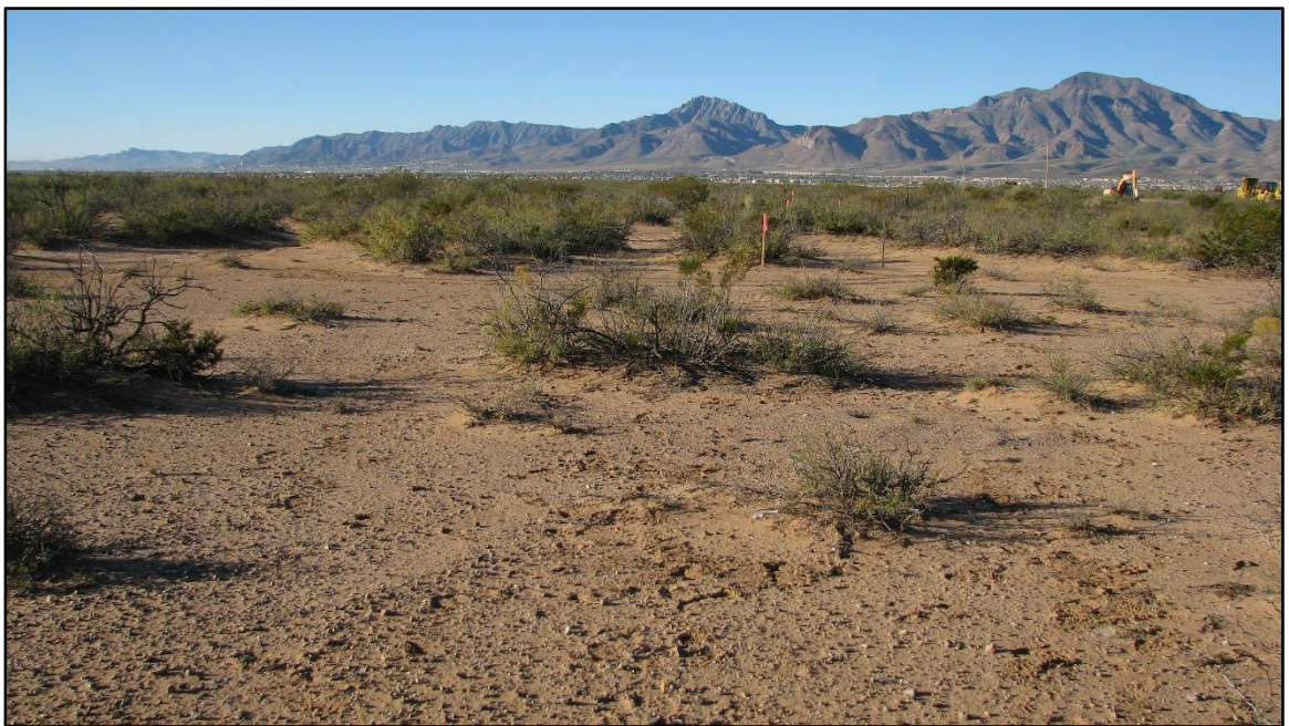
Figure 4-3. Survey parcel looking northwest, parcel boundary demarcated by wooden lathes.