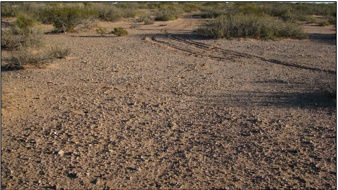
Figure 4-5. Survey parcel, looking east northeast. Note alluvial gravel deposits in foreground.