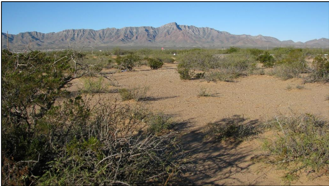
Figure 2-1. Photograph showing the general environmental condition of the project area, looking northwest. Note U.S. Highway 54 in the back ground and alluvial lag deposits in the foreground.

Current landforms consist of poorly-developed mesquite-stabilized dune fields, areas of interdunal deflation, and shallow sand sheets characterized by gravelly alluvium (Figure 2-1). Impacts to the parcel currently noted result from ongoing eolian and erosional deflation and previous highway development; a graded easement parallels the current survey corridor. The Kinder Morgan pipeline corridor demarcates the northern edge of the survey parcel. The soils throughout the project area consist of unconsolidated eolian sediments, light tan sandy loams, and low to moderate amounts of alluvium-related gravels and cobbles.