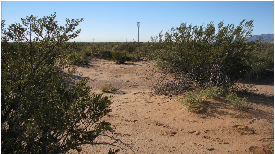
Figure 4-1. Southwest portion of the survey parcel, looking east-northeast.

This project entailed an intensive pedestrian survey of a 5.94-acre parcel in El Paso County, Texas. The survey was confined to the established footprint, which parallels U.S. Highway 54. The condition of the project area appeared to be generally intact. However, as proximity to the highway increased, the level of disturbance increased. In these areas, disturbance from road development and maintenance were clearly evident (Figure 4-1 through Figure 4-5). Moreover, eolian deflation and alluvial action has, over time, removed and redistributed sediments, creating deflation basins and gravel deposits throughout the project area. Low-to-medium sized mesquite stabilized coppice dunes anchor sediments in the parcel. Ephemeral rills and several shallow arroyos have impacted the landscape. Dune margins and exposed dune facies were closely examined for evidence of buried cultural deposits. No archaeological sites were identified; no isolated finds were encountered.