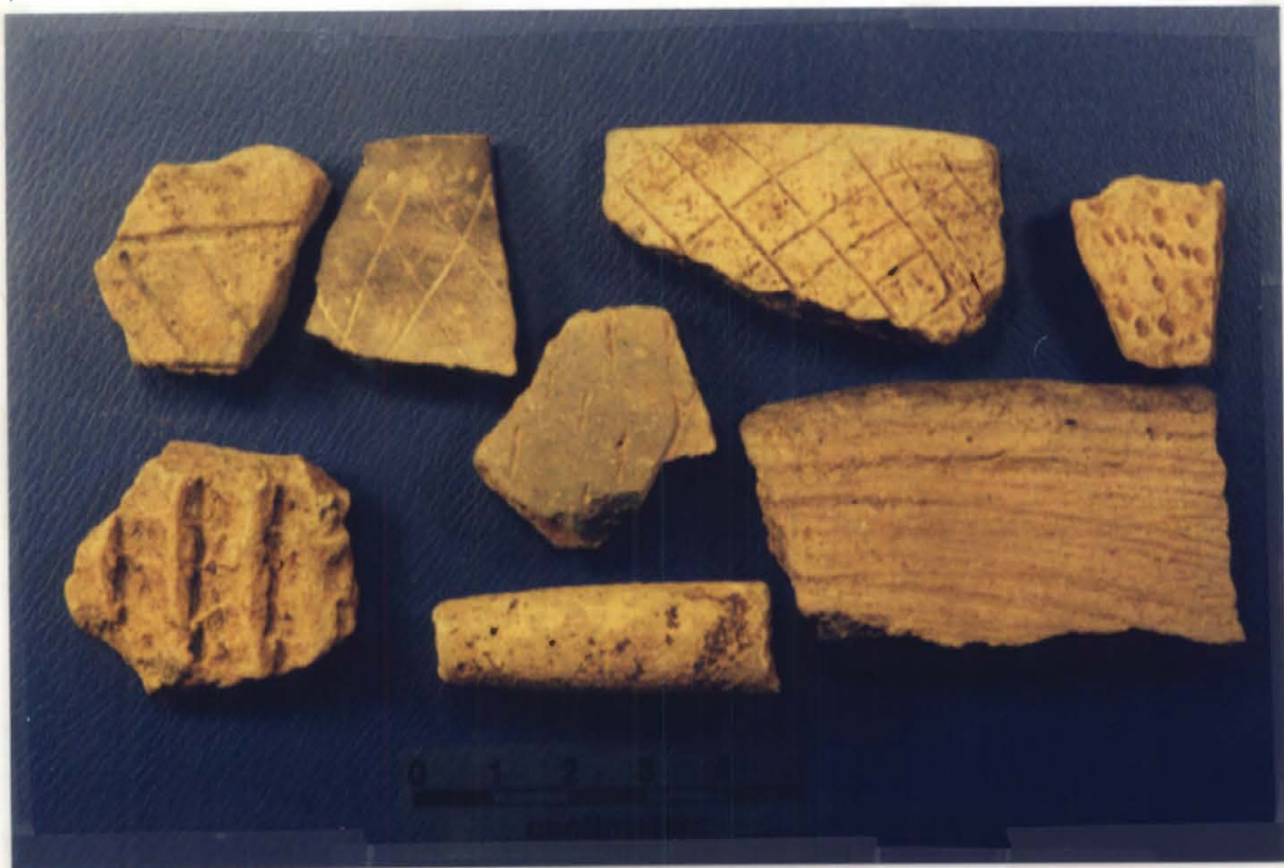
Figure 2. Decorated Ceramics and Pipe Sherd from the 852 Bridge Site (41UR210)