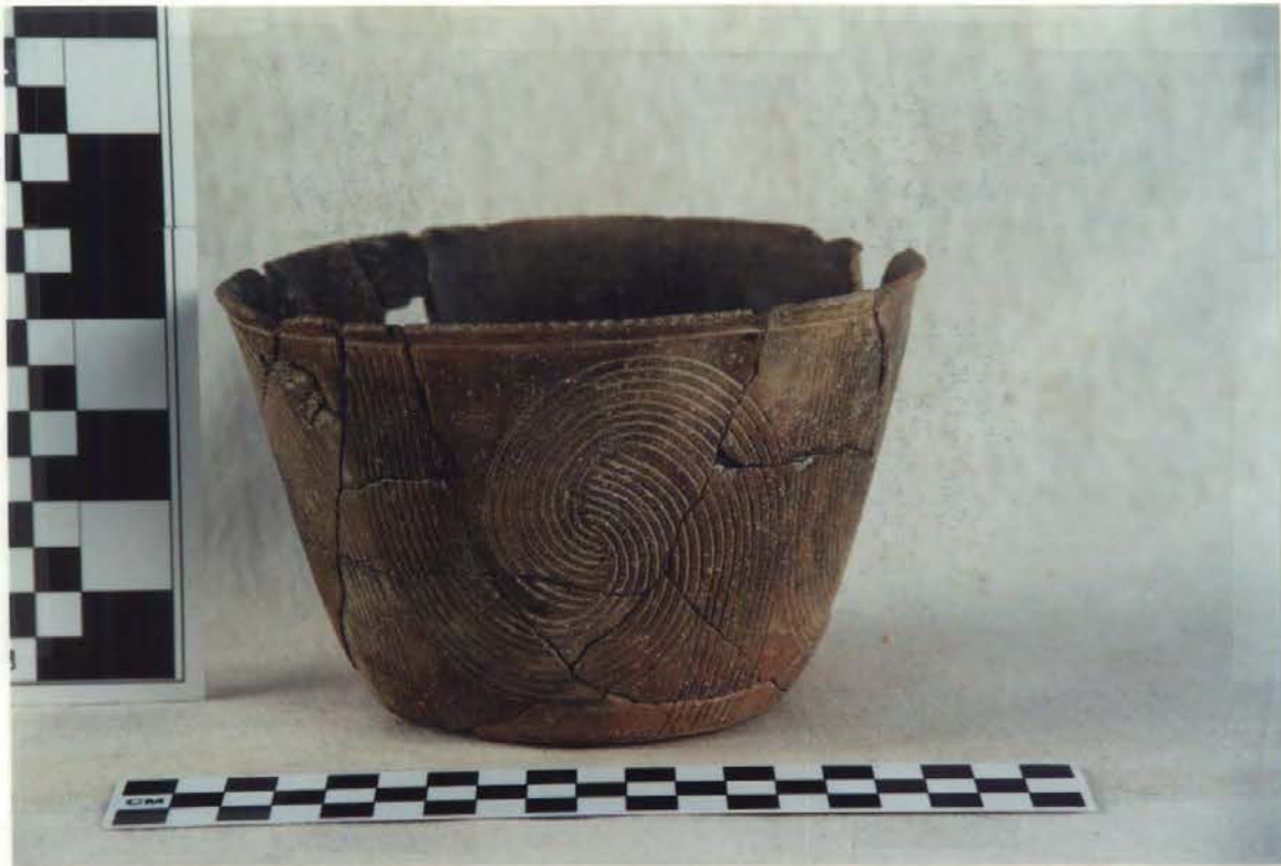
Figure 3. Keno Trailed vessel from the Spoonbill site.