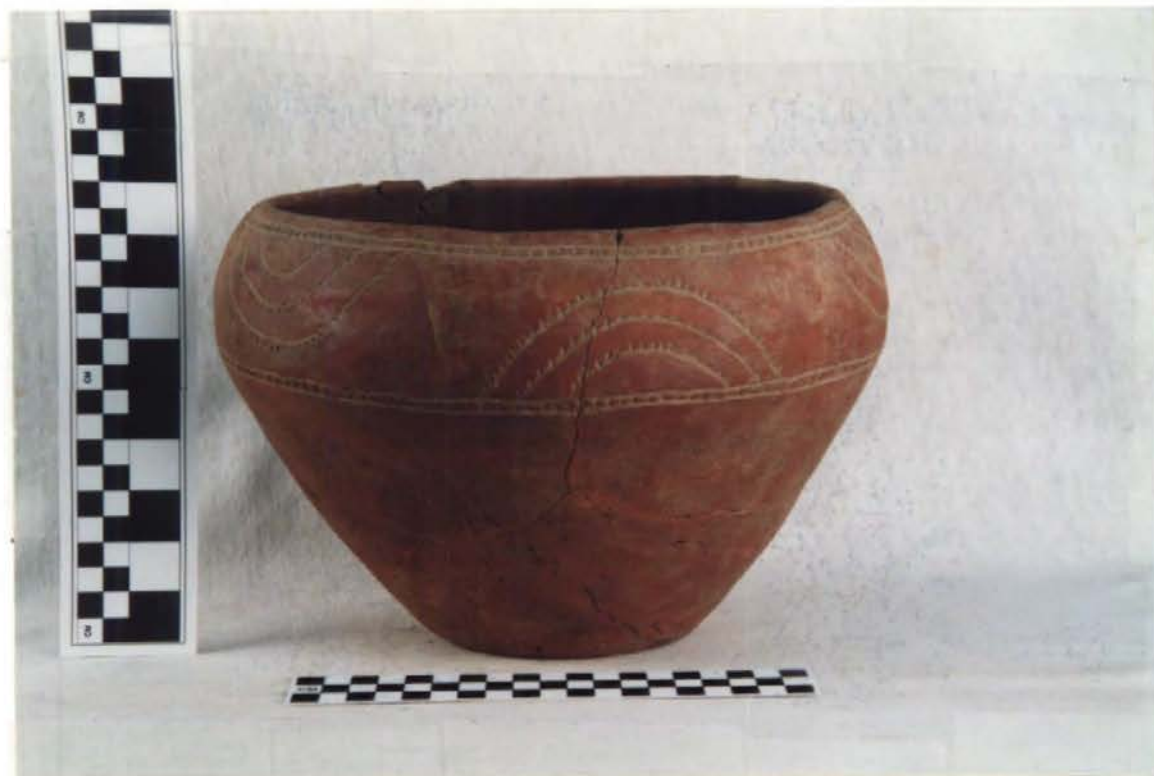
Figure 2b. Inverted rim and red-slipped vessel with ticked semi-circles.