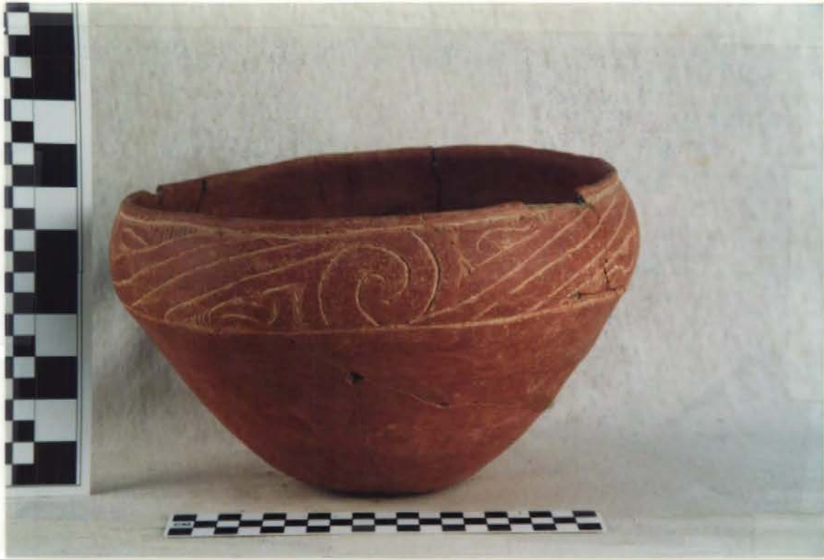
Figure 2a. Inverted rim and red-slipped Taylor Engraved vessel from the Spoonbill site.