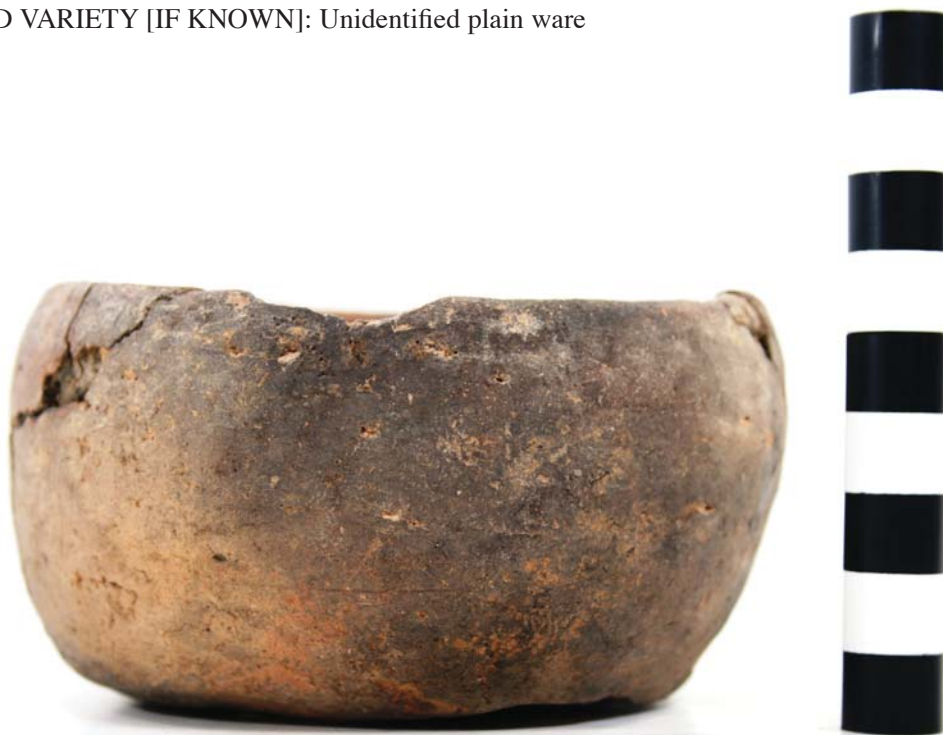
Figure 1. Plain bowl, Mrs. Martin Farm site.

TYPE AND VARIETY [IF KNOWN]: Unidentified plain ware