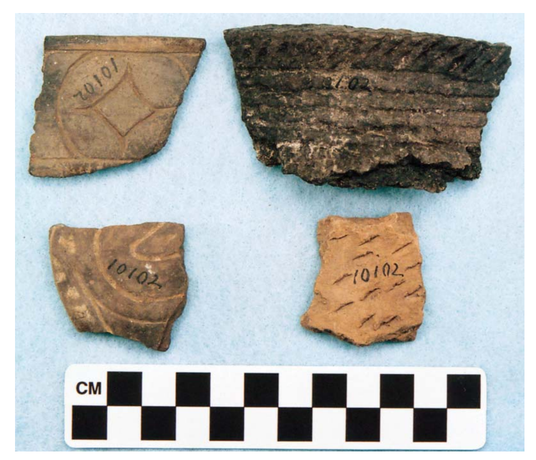
Figure 3. Other fine ware and utility ware sherds collected by J. M. Glasco. Catalog #A010102, NMNH.