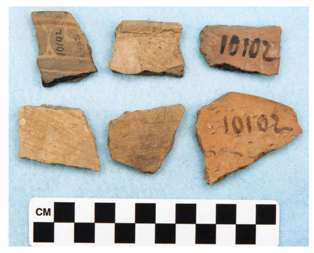
Figure 4. Engraved and utility ware sherds in the Glasco Collection at NMNH. Catalog #A010102.