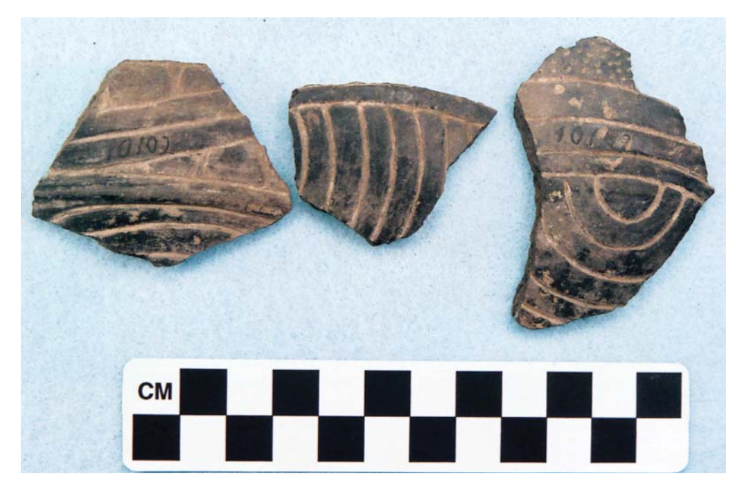
Figure 2. Bailey Engraved bottle sherds. Catalog #A010102, NMNH.