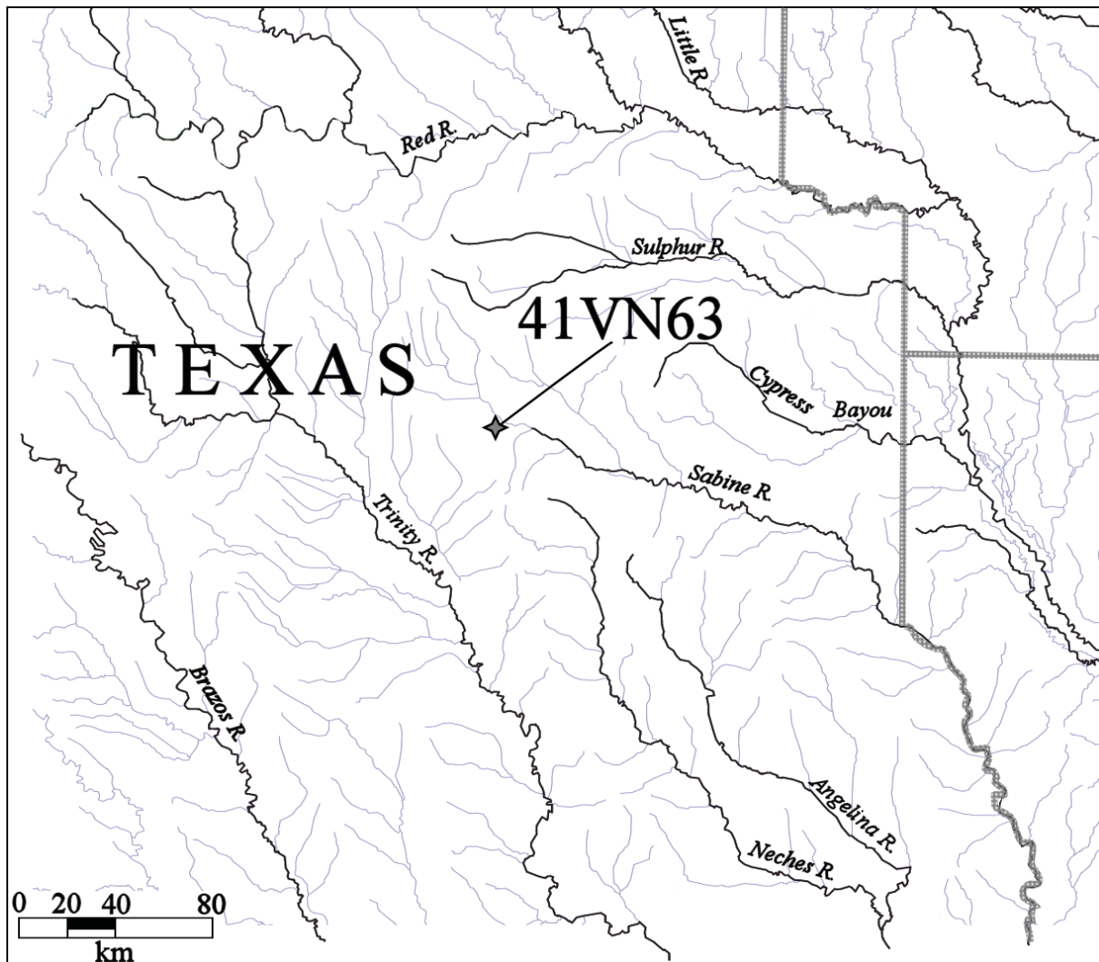
Figure 1. The general location of 41VN63 in East Texas.

Site 41VN63 is a multiple component Late Archaic (circa [ca.] 5000-2500 years B.P.) and Woodland period (ca. 2500-1150 years B.P.) site on an upland landform in the upper Sabine River basin (Figure 1). The site was recorded by James Malone (1972) during the archaeological survey of then-proposed Mineola Reservoir on the Sabine River; the reservoir has not been built.