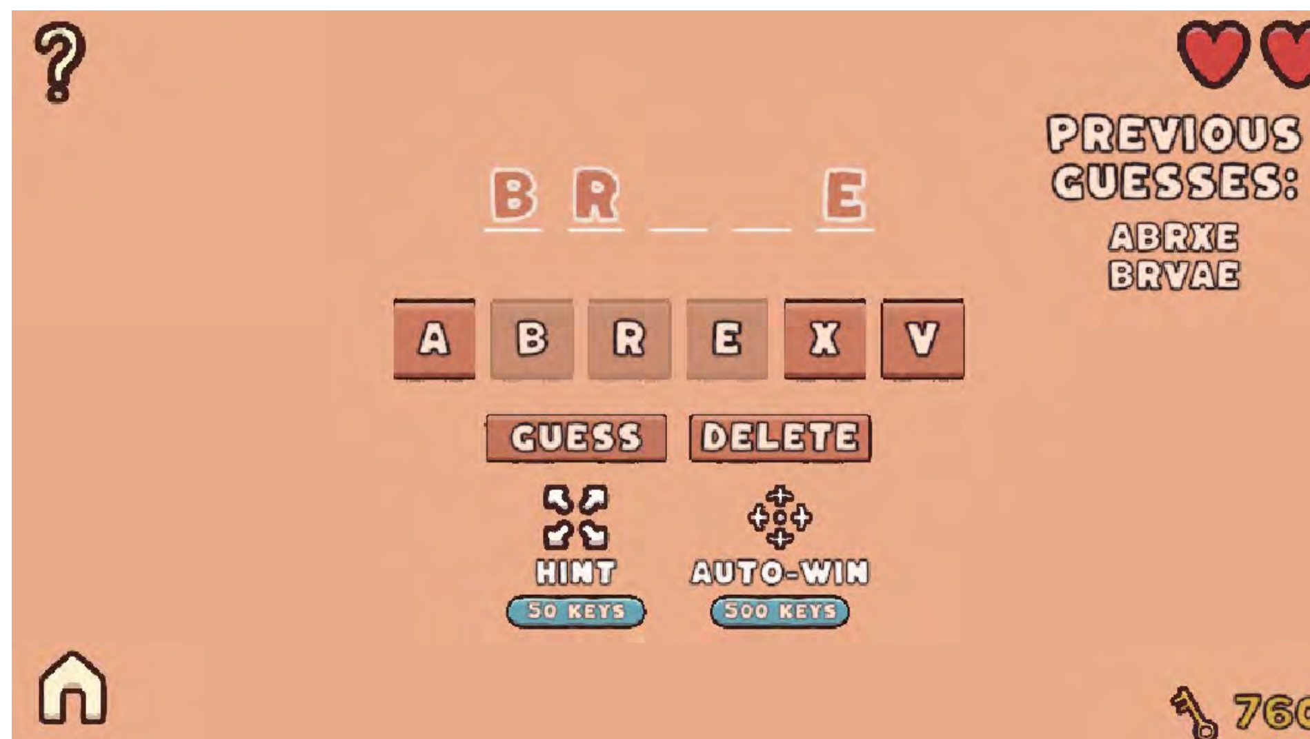
Figure 3 A screenshot displaying a test game of the Unity-Based version playing level 1 difficulty 2

Strategies had to be developed and tested for each of these categories. For example, when finding a method to prevent repeating words, the first idea discussed was to create a List for the words that had already been used and iterate through that List when selecting a word to ensure it did not already exist in that List. This strategy was eventually scrapped in favor of using a HashMap called usedWords that stored the word sorted alphabetically in its key and the word in its value. This decreased the time complexity and allowed for an easier method of checking if the word was already stored by checking whether or not the method .get(word) returned null.