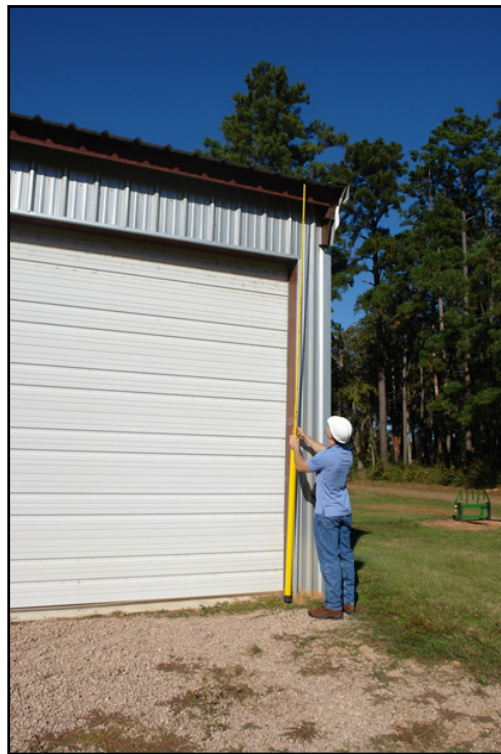
Figure 6. Measuring actual building feature height with a telescopic height pole.