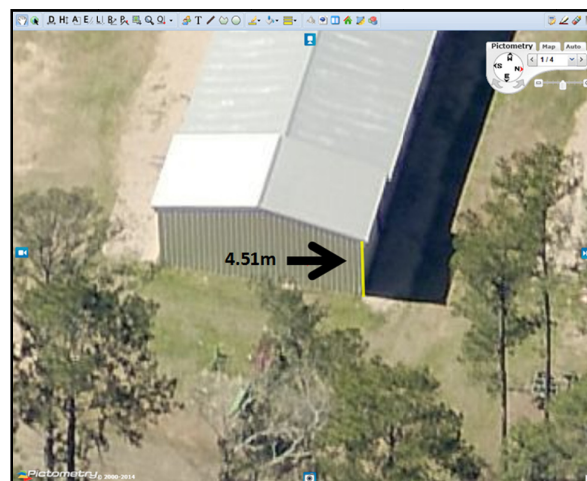
Figure 3. Example of estimating building feature height within the Pictometry web-based interface.