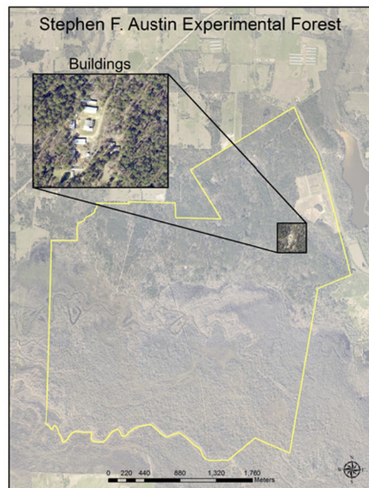
Figure 1. Study site depicting buildings within the U. S. Department of Agriculture, Forest Service, Stephen F. Austin Experimental Forest.

The SFAEF was chosen as the study site due to its proximity and accessibility to SFA students and faculty, is the only geographic area within close proximity to SFA that has both LiDAR and Pictometry data coverage, and has buildings within the coverage area with physical dimensions that would not change between dates of remotely sensed data acquisition and in situ measurements (Figure 1).