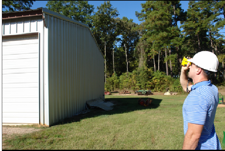
Figure 5. Estimating building feature in the field with a laser rangefinder.