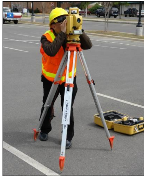
Figure 4. Measuring slope distance with a total station between the top of a light pole and a ground level coordinate identified within a central parking lot on the residential campus of Stephen F. Austin State University, Nacogdoches, Texas.