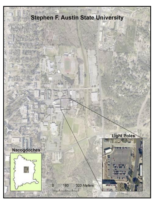
Figure 1. Locations of light poles were within a central parking lot on the residential campus of Stephen F. Austin State University, Nacogdoches, Texas.