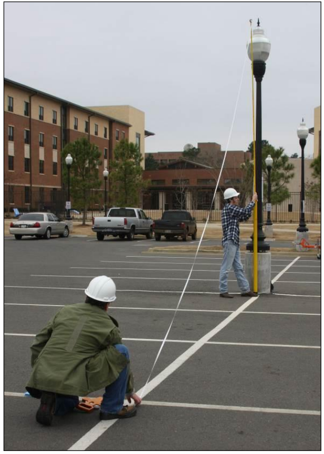
Figure 5. Measuring slope distance with a tape between the top of a light pole and a ground level coordinate identified within a central parking lot on the residential campus of Stephen F. Austin State University, Nacogdoches, Texas.

measuring total station and tape slope distance in situ , and by two separate individuals, to eliminate slope distance measurement bias between in situ and remotely measured slope distance. All slope distance measurements resulted in a triangle representing ground distance, slope distance and degree angle between a light pole and its corresponding ground level coordinate (Figure 6).