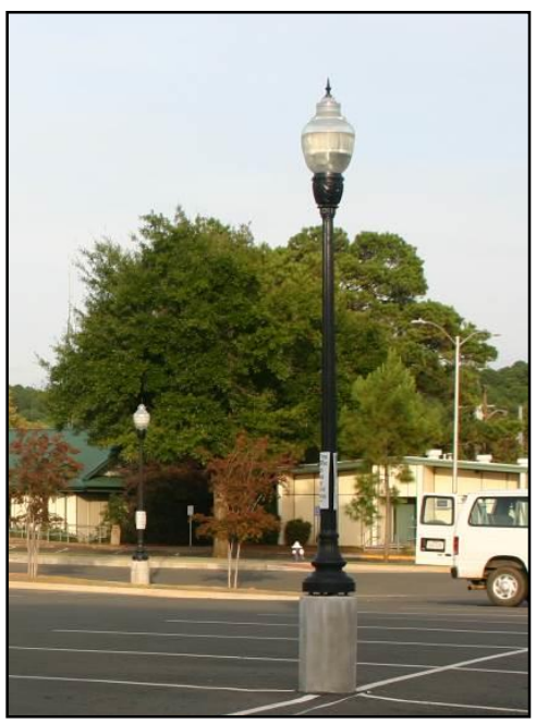
Figure 2. Representative light pole within a central parking lot on the residential campus of Stephen F. Austin State University, Nacogdoches, Texas.