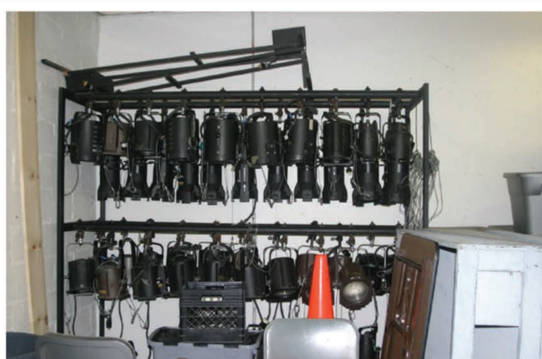
Lighting instrument storage