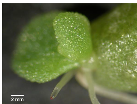
Figure 1: Sedum wrightii propagule and root after 14 days incubation of detached leaf. The root on the left-side of the photo is 1 day old

Sedum wrightii , a member of Crassulaceae, is a succulent plant that has thick, fleshy leaves arranged in spiraling rosettes around the stem [1]. Leaves easily detach with slight pressure [2]. Clausen [1] states S. wrightii reproduces either sexually through flowers or asexually from detached leaves. Clausen [1] and Gravatt and Taylor [3] report, roots grow from the detached leaflets and eventually become long enough to reach the soil. Sedum wrightii grows primarily in limestone soil and has been reported in Sierra Madre Oriental and adjacent Mexican Plateau, the Davis Mountains in Texas, and on the edge of Edwards Plateau in Texas. The climate is arid and the vegetation includes large desert shrubs and herbs [1]. The focus of this study is on the adventitious root tips of the detached leaflets of S. wrightii where the accumulation of a red-purple pigment was clearly observed to be associated with the root cap and meristematic regions of the root tip (Figures 1 and 2).