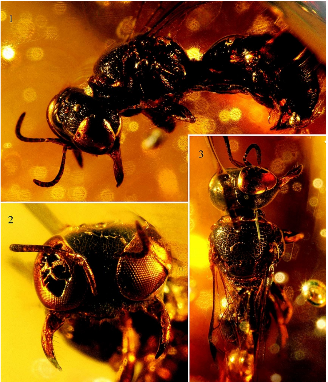
Figs. 1–3. Photomicrographs of holotype female of Lindenius paleomystax , new species (AMNH DR-14-1091). 1. Oblique lateral habitus. 2. Facial aspect. 3. Dorsal aspect.