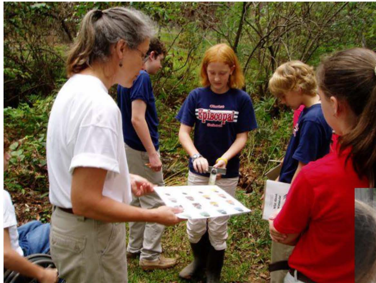
Students from Christ Episcopal collected soil samples and observed its color to determine if the area was a true wetland.

PNPC. Macro-invertebrates are collected from the water and used as indicators of water quality.