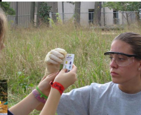
Soil pH was determined at several sites in and around the bog.