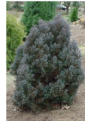
Thuja orientalis var. juniperoides

If you can answer yes to any of the above rhetoric, fear not. Although I cannot solve all your gardening winter woes, perhaps I can help: it may be time to consider a conifer. As some of you know, the Arboretum has been boldly plowing into the world of ornamental conifers for the last few years, and we are emerging victorious. Many specimens of this ancient group of plants previously thought impossible to grow in Texas have proven themselves quite hardy. We've scoured the globe for new