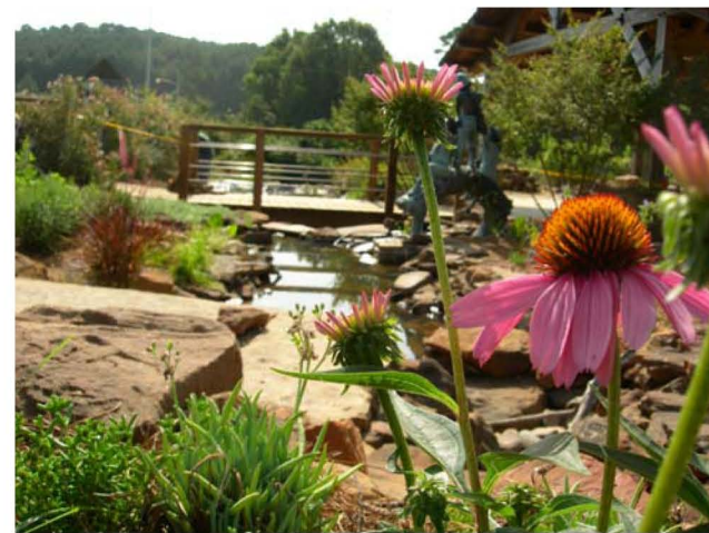
Design, construction, beautiful water garden...easy as one, two, three?!