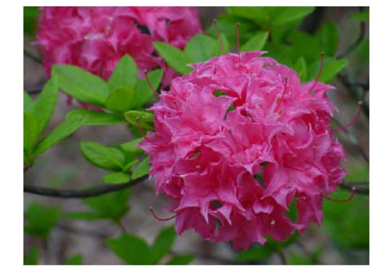
Native selection of R. calendulaceum x R. pericylmenoides 'Homebush' by Azalea Society of America member Joe Schild

the plants look like they are bearing pink or yellow snowballs. (We are still hoping to get a few of the latter forms). Most bloom just before or during the time that the shrubs leaf out. We have 236 different taxa in the Ruby M. Mize azalea Garden; that is, 236 different genus-and- species or genus-and-cultivar combinations. Three species and their relatives do especially well here: Rhododendron austrinum , the Florida Azalea; R. canescens , the Piedmont Azalea; and R. viscosum , the Swamp Azalea.