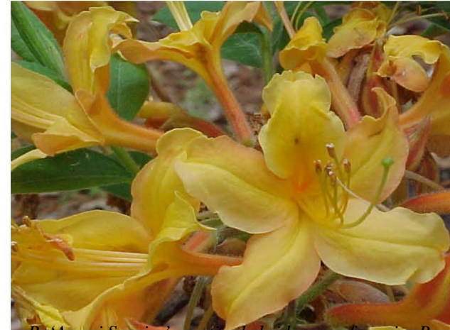
R. Aromi Sunrise a native hybria cross of species R. austrinum with Knap Hill hybrid 'Hiawatha'.

Nursery in Aiken, South Carolina. Because of this breeding work, our deciduous azalea colors range from pale pink through bright orange and into salmons, golden yellows, and even a yellow with a white edge. Come visit the garden during the Nacogdoches Azalea Trail, March 16-April 9, 2005, and enjoy our natives.