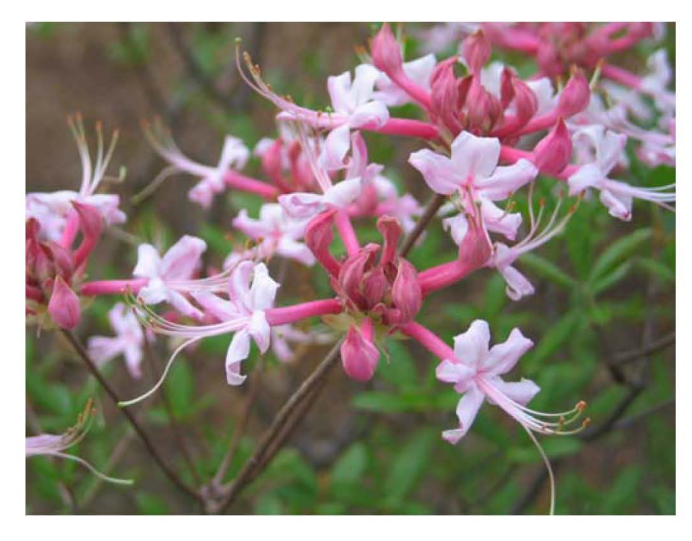
Native selection, R. canescens 'Phlox Pink' (Bed 27)