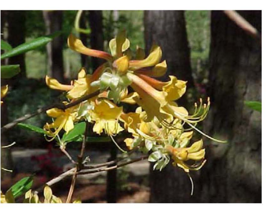
Species Rhododendron austrinum (Bed 2).

Nurserymen in the past 30 years have been actively selecting promising seedlings (from seed collected from superior plants) and by breeding and crossing for certain desirable traits (using the pollen from one