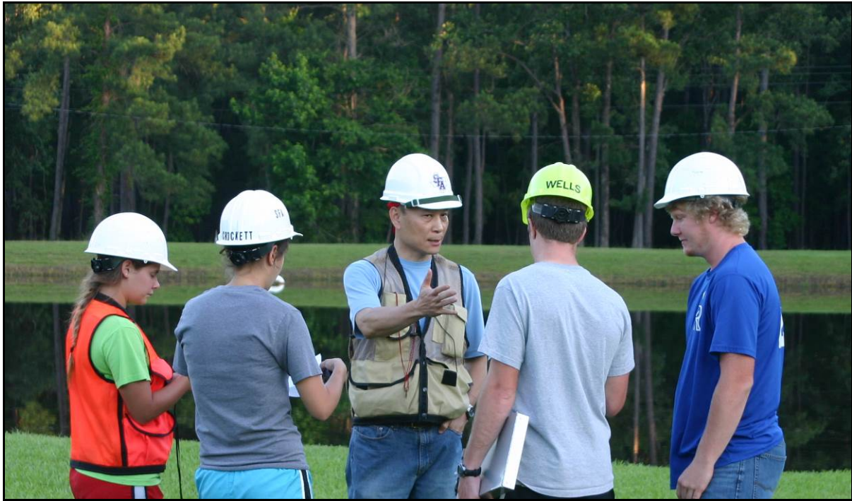
Figure 3. Students receiving one-on-one faculty instruction on how to collect a waypoint and calculate area on the island within the confines of the Piney Woods Conservation Center

users preferred unit of measure (Milestone 2). This is the pre-test measure prior to the field project.