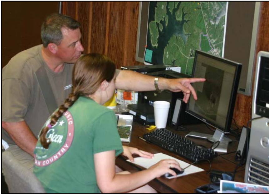
Figure 5. Students receiving one-on-one faculty instruction on how to transfer the collected waypoints and tracks within the Garmin eTrex Legend® HCx to ArcMap 10.1 using DNRGPS software to communicate between the Garmin eTrex Legend® HCx and ArcMap 10.1 after returning from the field