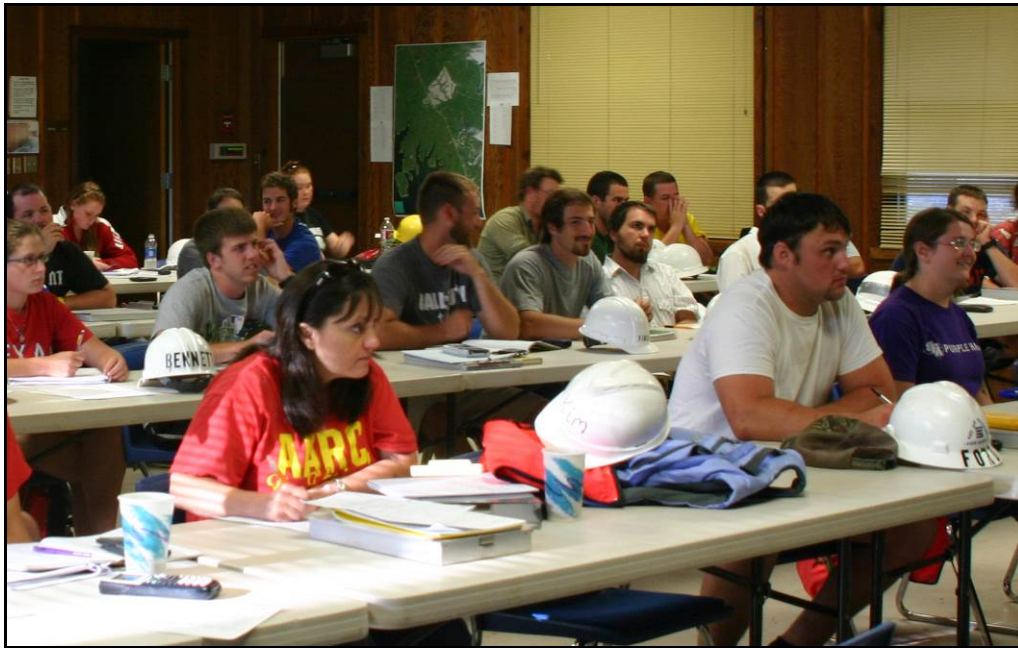
Figure 2. Students are instructed in the central classroom how to enable their Garmin eTrex Legend® HCx GPS unit to ensure Satellite Based Augmentation System data collection for their point, line and polygon data

These satellites in turn distribute the correction message to GPS receivers that can apply the real time corrections in the field to increase waypoint accuracy thus increasing the accuracy of any derived real-world unit (Arnold and Zandbergen, 2011; Federal Aviation Administration [FAA], 2010). Federal Aviation Administration specifications require that WAAS will provide 7.6 meter horizontal accuracy, a sizable improvement on the 10-15 meter accuracy that is usually specified for most consumer-grade GPS units gathering data autonomously (FAA, 2008).