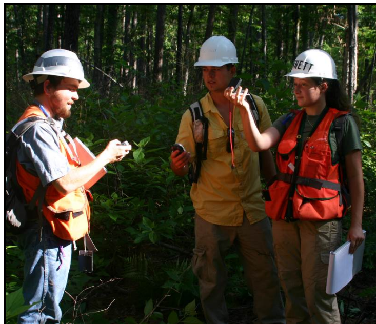
Figure 4. Students collecting waypoints and track logs to calculate the length and area of faculty chosen waypoint and area locations within the Angelina National Forest

For students pursuing the BSF degree within ATCOFA knowing how to record an actual location and calculate an accurate perimeter and area of a polygon is crucial to the understanding and proper management of natural resources. To achieve that objective, the six students groups were instructed within the computer lab how to assess the accuracy of their GPS collected waypoints by deriving the Root Mean Square Error (RMSE) between their GPS collected locations and each waypoints real-world location (Table 2) (Milestone 3). The interactive GIS lab was used to reinforce one-on-one faculty interaction to increase a student's retention of the presented material. RMSE was utilized so the students could evaluate and quantify the effectiveness of their ability to acquire accurate real-world coordinates. An RMSE analysis was also used to evaluate and validate the effectiveness of the one-on-one faculty instruction demonstrating how to acquire accurate perimeter and area measurements of polygons within the Angelina National Forest (Table 3a and 3b).