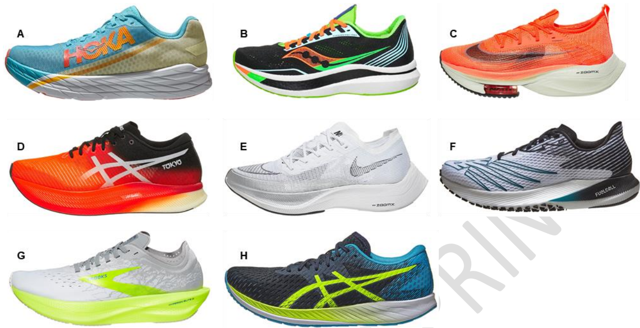
Fig. 1 Shoes tested included 7 carbon-plated racing shoes: A) Hoka One One Rocket X, B) Saucony Endorphin Pro, C) Nike Air Zoom Alphafly Next%, D) Asics Metaspeed Sky, E) Nike ZoomX Vaporfly Next% 2, F) New Balance Fuel Cell RC Elite, G) Brooks Hyperion Elite 2, and one traditional racing shoe: H) Asics Hyperspeed