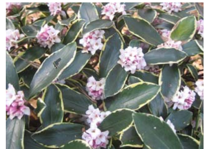
Daphne odorata 'Aureomarginata'