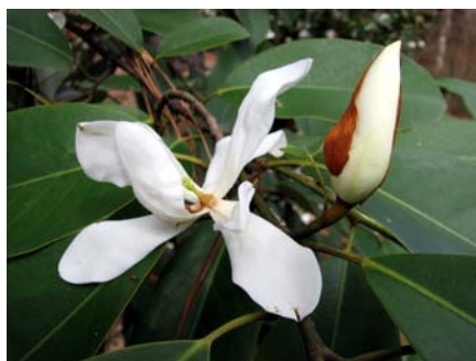
Michelia platypetala blooms in the Azalea Garden

Michelia platypetala in full bloom for the very first time in our garden, in Texas, and in our region. There were no bands, no parades, and the media was conspicuously absent. Yet, it's really what we're all about. Strange and wonderful plants. Over the years, we've put together a rather long and exciting list of michelias that now call this place home. Michelia figo , banana shrub, is an old-timer from China and this fragrant shrub has graced southern gardens since the late 1700s, but there's been a