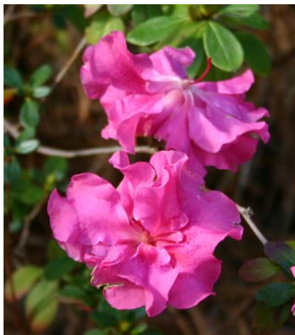
Rhododendron 'Scott Gartrell'

Our theme for the annual Nacogdoches Azalea Trail Symposium gives you an idea of the breadth of azalea gardening in East Texas and Louisiana. Last year's symposium, as you may remember, was a big event for us when for three days the Arboretum hosted 85 people from the national Azalea Society of America annual convention. This year, we will hold the symposium on March 29, in Room #110 of the SFA Agriculture Building at Stephen F. Austin State University from 8:30 a.m. to 3 p.m. With the repeated cold snaps we've been having, we hope to have peak bloom in the Ruby M. Mize Azalea Garden, just as we did last year on that date.