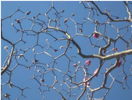
Magnolia x 'Spectrum' branches against a clear blue sky

Every now and then, when the “dull-drums” of winter beat on, there are bright sunny days with a hint of warmth in the air. The sky is bluer than any other time of year, and periodic bursts of color can be found sprinkled throughout the garden. The gaudy blooms of deciduous magnolias promise that there is still life in a lifeless landscape. While it’s hard to miss these beauties, there are many, almost inconspicuous blossoms seemingly everywhere. Lucky for us, and some early-bird honey bees, our noses are often the best tool in locating many a spring treasure.