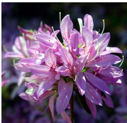
Rhododendron stenopetalum 'Koromo Shikibu'

ing with the azalea gardens at Callaway Gardens in Georgia and is presently president of the Texas Chapter of the Azalea Society of America. He will present the historic design of Houston's oldest formal azalea garden (1920s-1940s) and tell how he has converted it to a totally organic public garden .