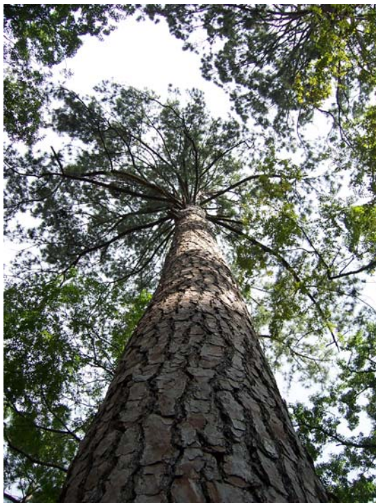
A loblolly pine towers over the Pineywoods Native Plant Center

attend Texas A&M University at College Station. But I distinctly remember leaving the pines behind in Crockett. It was like leaving your grandmother's house and heading into a strange strip center parking lot. Something immediately didn't seem right. I didn't just miss the pines; I missed all the tall trees. It got worse when I worked for the Extension service in Dallas and eventually in San Antonio. I finally figured it all out on my many trips home from San Antonio. My entire mood would