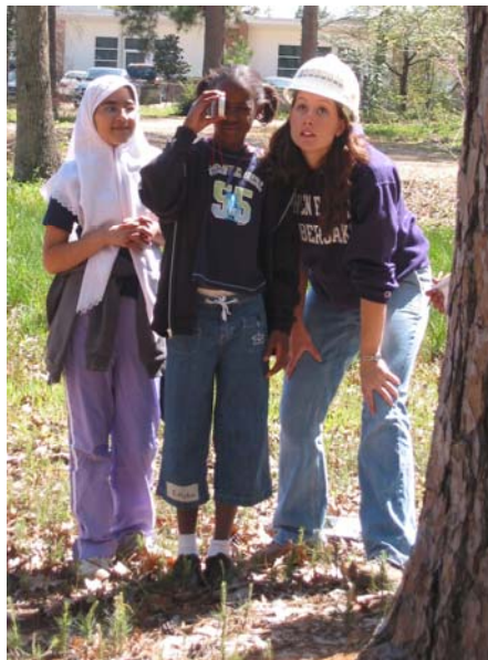
SFA Forestry student teaches Raguet Elementary students how to measure tree height with a clinometer

like Tiffany. I love learning, and I learned outside!"