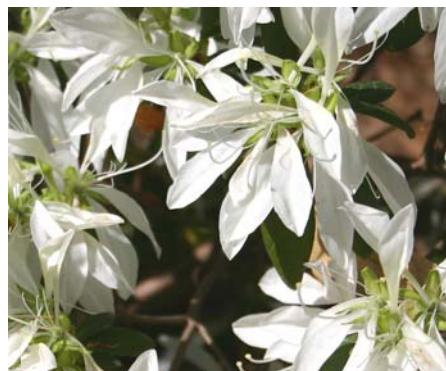
Rhododendron 'Primitive Beauty'