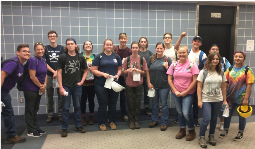
Library portion of Root Camp, group photo, spring 2018.

To lessen library anxiety, and play an active role in promoting the development of new learning communities by connecting with students early in their careers, librarians at SFASU were able to snag a little piece of time during the Forestry freshman orienta-