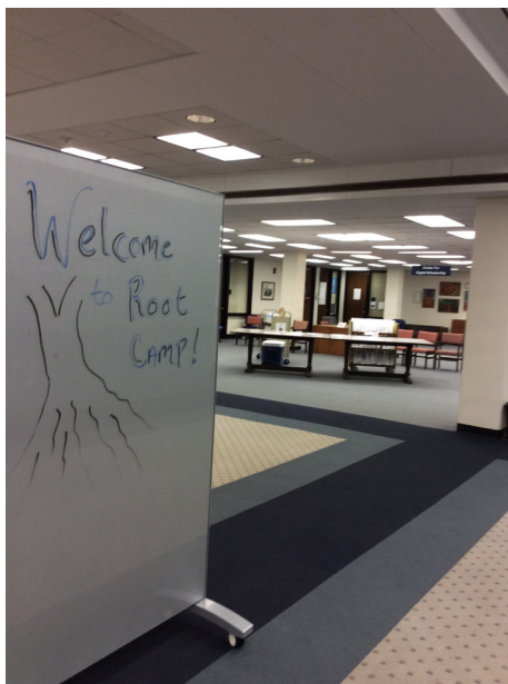
Welcome sign for library portion of the 2018 Root Camp.

A learning community is defined as “an intentionally developed community that will promote and maximize learning.” 4 This building of community is of the utmost importance to new,