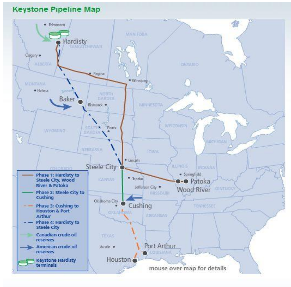
Figure 1: Existing & Proposed Routes – Keystone XL

The 1,700 miles of new pipeline, which began in August 2012, provides two new sections of expansion. The first section connects Cushing, Oklahoma, where there is a current bottleneck of oil, with the Gulf Coast of Texas, where oil refineries are dominant. The second section (Phase IV) includes a new section from Alberta to Kansas where it passes through Bakken Shale region of eastern Montana and western North Dakota. TransCanada changed the original proposed route of Phase IV of the Keystone XL to minimize "disturbance of land, water resources and special areas" and the new route was approved by Nebraska Governor Dave Heineman in January 2013. This region is popular for its oil extraction and this extraction is currently booming; therefore, TransCanada is interested in taking on some of this crude for transport. The specific states in the U.S. the pipe travels through is Montana, South Dakota, Nebraska, Kansas, Oklahoma, and Texas. The line crosses through 16 counties in North and East Texas. The following map lays out the existing and earlier proposed routes of the pipeline. The already existing pipeline is represented by the solid lines and the proposed pipeline by the dashed lines (StateImpact Texas (2012)).