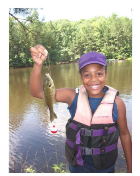
Nice catch! Bass fishing at Mill Creek Pond

experience with a cane fishing pole). There were delicious snacks, silly games, crazy crafts, walks through the Tucker Woods, and songs galore. What a great week to start off the camp season!