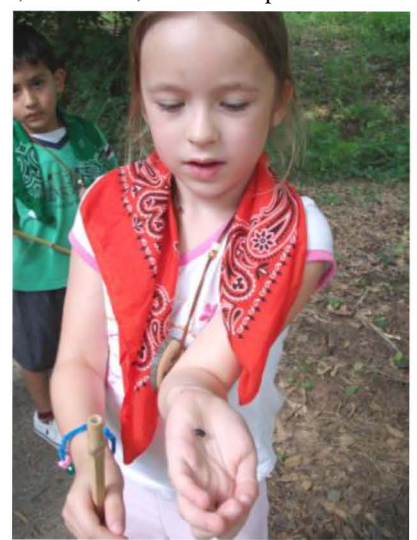
Discovering insects on a nature hike

For the past nine years the education component of SFA Mast Arboretum and Pineywoods Native Plant Center has sponsored outdoor education summer camp programs for children. This year Pineywoods Summer Camp had four extraordinary weeks of camp for kids ages 4-15. Our theme for the year was "Better than Ever!" and indeed the goal was achieved with dedicated, hardworking staff, volunteers, and 79 campers.