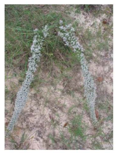
Liatris elegans - pinkscale blazing star

Liatris pychnostachya, prairie blazing star, is one of the showiest Liatris species. They typically grow to around 2 to 4 feet in height and have smaller, denser flower spikes than the tall blazing star. This plant does very well in full sun if it is tightly planted next to other plants. Tighter planting allows for better "neighborly" support for the flower stalks, which in turn allows them to grow taller and fuller than normal. There are a few selections that have been made in the trade for other colors such as white and darker pink. Liatris pychnostachya can be found in the wild in prairie settings where either the soil is very clayey or sandy. All in all, this is one durable beautiful native plant for your garden that can withstand our extreme temperatures