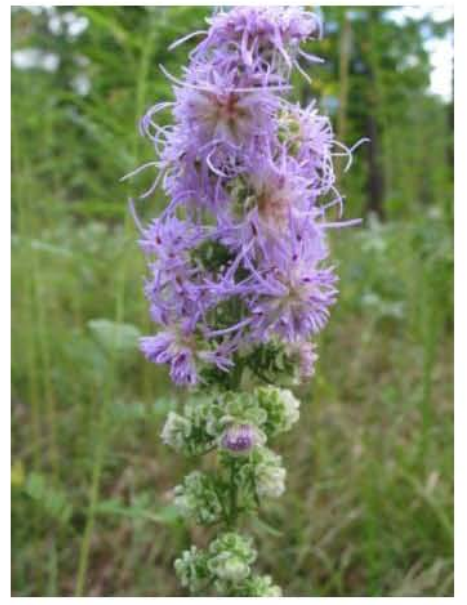
Liatris aspera -tall blazing star

In my opinion, Liatris elegans , pinkscale blazing star, has yet to be fully appreciated by the horticulture industry, and that's a shame. This plant is best suited for those driest-of-dry locations to which you never give any attention. It is commonly found on very well-drained, low-fertility soils in the