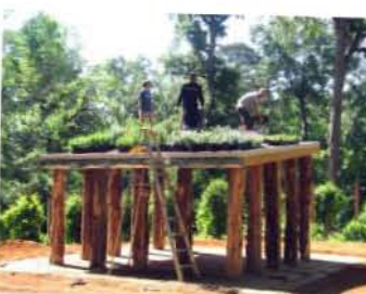
Planting the green roof pavilion at the Pineywoods Native Plant Center

wide assortment of dryloving native plants is thriving. I actually think they're enjoying their roof top view of the place. Built and designed by Trey Anderson, our PNPC research associate, this may be the only green roof in the world actually designed for a controlled burn! Before we set the roof on fire, I may need to make a If you live in Nacogdoches, quick trip up to legal counsel. There are rules here, vou know.