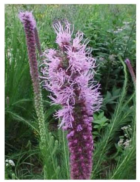
Liatris pychnostachya - prairie blazing star

Liatris aspera, tall blazing star, is the tallest of the three listed above, although I have seen specimens of the others that are close rivals. L. aspera has the largest actual flower of the three, but typically fewer in number than the other two species. Generally speaking it will reach heights of 3-5 feet and flowers will be ½ to 1 inch deep rosepurple and appear fluffy round head. Flowers are arranged closely together on long,