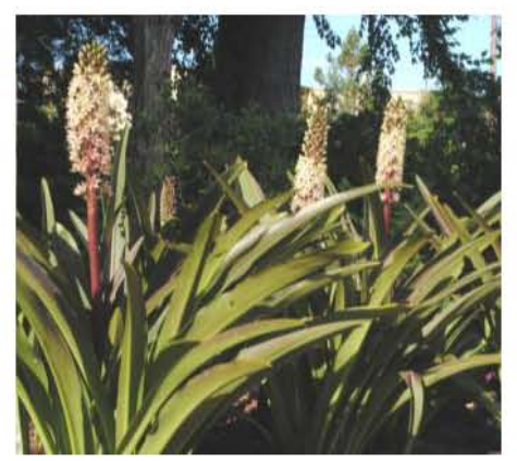
Eucomis comsa 'Sparkling Burgundy'

Over the years, we've grown many a pineapple lily (Eucomis comosa) here in the Mast Arboretum. I have so wanted to like them, but until recently have been wholly unimpressed. Admittedly, there are times when I am wrong, and this time it took a long time to learn my lesson. For years, we considered this a shade plant and they did in fact grow in the shade. They did eek out an anemic bloom or two that usually flopped gracelessly to the ground before fully opening. Then I saw a nursery grown specimen in a black pot, on black weed barrier with nary a spot of shade in sight. Hmmm. I'm willing to try any plant three times, and I was still on my first attempt. Number two landed in the old perennial border that was slowly being eaten by a chameleon plant gone awry. The last chance: a spot with good soil, a fair amount of sun and the last hope. These plants have been in the ground for three summers now