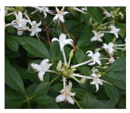
Rhododendron oblongifolium - "Texas Azalea"

and horticulture student Taylor Wynn, a space has been cleared of privet and limbed up so that appropriate deciduous species azaleas and other native plants can be planted there. This fall, when the weather is cooler, our chapter will help Duke with the planting. An example of the deciduous azaleas the chapter purchased from Doremus Nursery in Warren, Texas, for this project is the "Texas Azalea"—R. oblongifolium , a beautiful late-blooming fragrant white. To learn more about the local chapter, contact me at bstump@sfasu.edu or 936-468-4129.