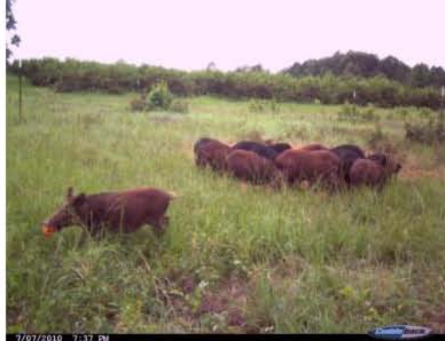
Baiting hogs with rotten peaches in East Texas

To be honest, I always figured, heck, all those pig problems are north of SFA. Surely, they won't cross Austin Street. That ended about a year ago. At first, it was just an occasional sighting or sign down in PNPC's bottomland. We could live with that. Then there was evidence they were rummaging around the Tucker House and stream. We were unhappy.