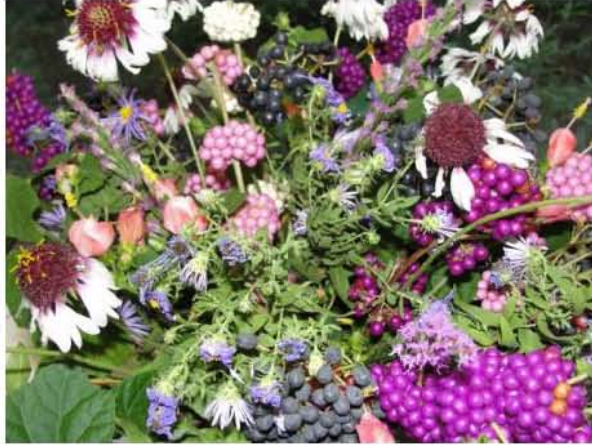
A bouquet of natives including firewheel, beauty berry and fall aster.

flowers before they are fully open which makes them last longer. Full blown flowers are just waiting to