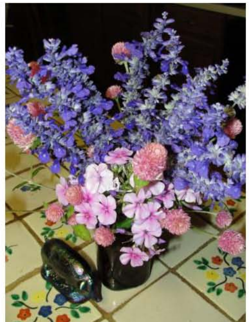
A summertime arrangement, including native mealy cup sage and garden phlox

"Grasses, Pods, Vines, Weeds-Decorating with Texas Naturals by Quentin Steitz" (University of Texas Press, 1987). Though out of print, it's well worth the search. I bought a valuable second copy at the local library book sale recently for 50 cents!