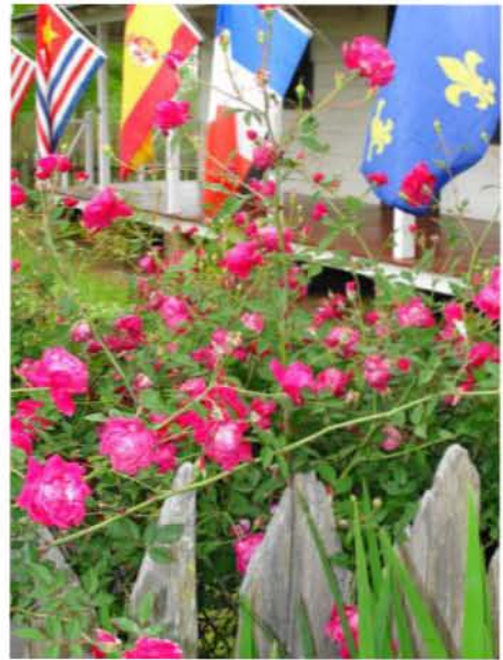
Rosa chinensis 'Louis Philippe'

'Slater's Crimson China' is the original parent of all modern red roses. 'Old Blush' is apparently the parent of the Portland, bourbon, and noisette classes and possibly others. The China rose is also the direct parent of tea, polyantha, and miniature roses. What a lineage!