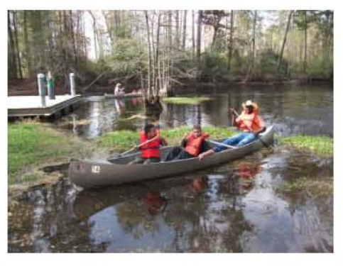
Canoeing with the family at Martin Dies State Park

Fun, fun, and more fun!! The family program of Nacogdoches Naturally has had a great time the past several months. We