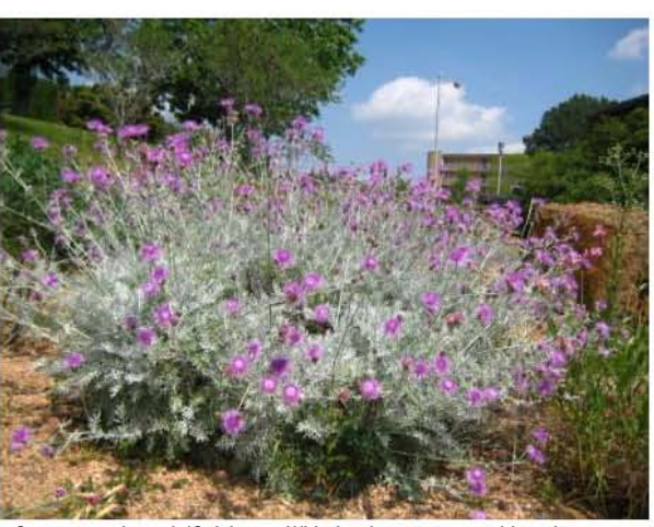
Centaurea cineraria 'Colchester White', velvet centaruea, blooming near the Kingham Children's Garden Pavilion

Penstemon did well for a while, but they seemed to really want a drink or two late in the summer. I've had really good luck with blue flax, rain lilies, autumn sage, false indigo, nierembergia, heliotrope, sundrops and so far this year with bluebeard