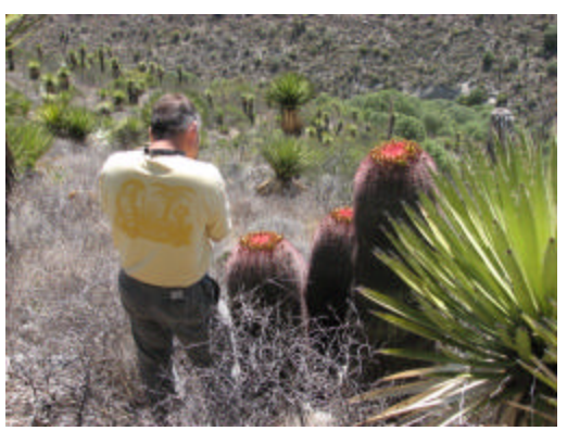
Sean Hogan photographs a group of Ferocactus pilosus

found, photographed and documented over 20 Agave species in Mexico, one stands out - an Agave potrerana in full bloom on the first day of our trip - 29° 21.672N, 106° 28.825W, and 5218' elevation. This special spot is to the west of Hwy 45 via the rocky road to Las Varas with Agave parryi scattered here and there on the road into the mountains. About four miles into the canyon, someone spotted a snake-like red and yellow inflorescence peeking over a ledge. After a brief scamper