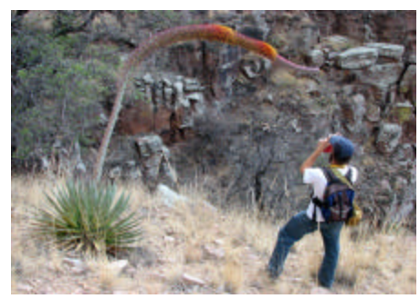
Rob Nixon stands next to an Agave potrerana