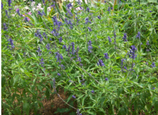
Salvia farinacea 'Henry Duelberg'

Salvia farinacea (mealy cup sage/blue sal-