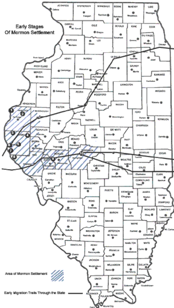
Map Showing Areas of Mormon migration routes and Mormon Settlement Prior to 1841