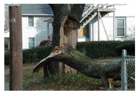
Poor tree structure + decay + nor'easter = disaster

That trees often fall, split, defoliate and generally suffer under hurricane force winds is not new news. However, why some trees or branches fail when others do not may sometimes be mysterious, but can often be explained by poor tree structure. Poor tree structure is common in landscape trees, and often the proper and systematic pruning required to develop good structure does not occur.