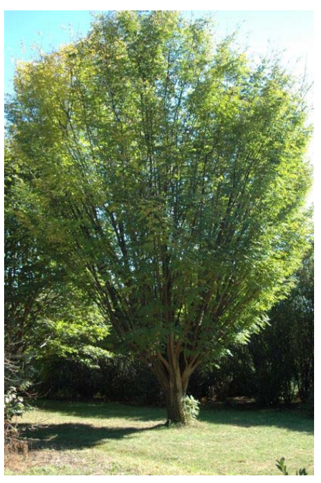
(Above) Open grown tree with low, tightly grouped branches which often results in included bark (Below). Branch on left should have been removed long ago. Doing so now would leave a large wound that would likely not completely heal.