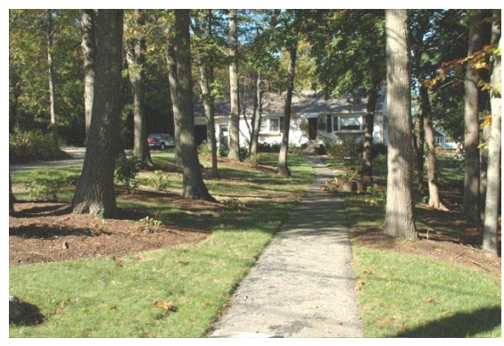
Trees growing close together in a forest type setting.

If you take the same species of tree (i.e. same genes) and plant it in an open landscape, the abundant sunlight and increased wind exposure will cause it to