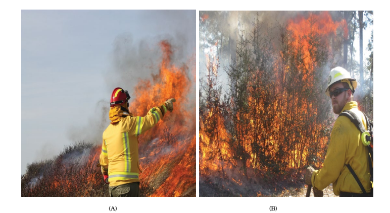
Figure 2: Prescribed burning in sea buckthorn (A) and yaupon (B).