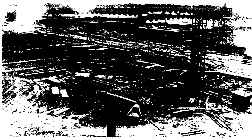
Photos on pages 16 and 17 are construction of the refinery's mechanical shops, circa 1919. The tent city in the background housed African American and Mexican laborers.

the workforce supplied. By the third week of September, the tension in Baytown had reached a fever pitch, leading to fears of violence. 25 Union activism raised race and class anxieties, the fear of communism led to fears of radicalism, and perhaps most important, the power of Humble Oil and Refining Company hung in the Baytown air like vapors from its refinery, ready to ignite into a full-blown war.