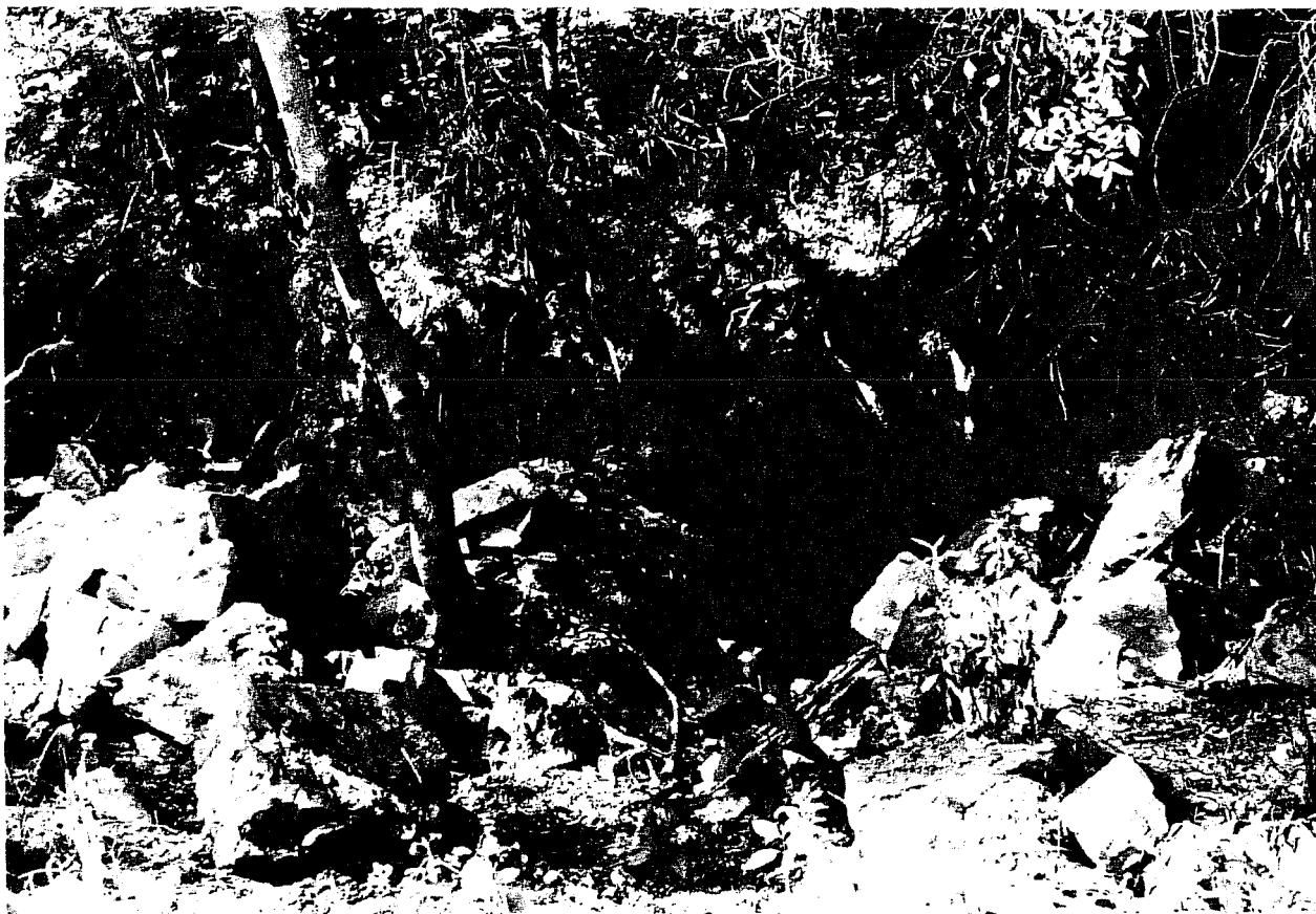
Figure 3. Worth's Spring . The spring is located near the northeast end of Olmos Dam.