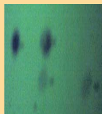
Lane 1 2 3