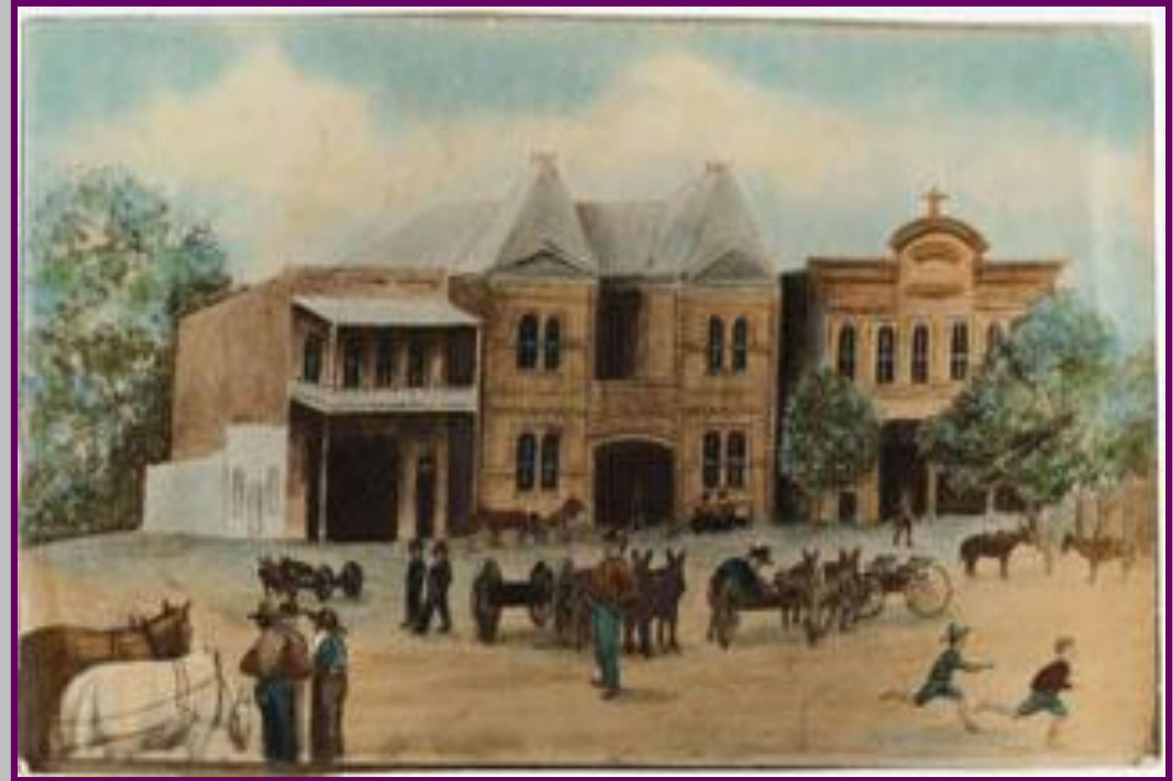
To better suit the town and its people a new courthouse was built downtown. This courthouse as seen in George Crockett's sketch was a clear depiction of Gothic architecture and Second Empire Baroque as seen by the unique roof shape with iron work at the top. After a fire almost destroyed the west end of downtown it was proposed that a new courthouse be built on the south side. Painting of the Third Courthouse. George, Crockett.