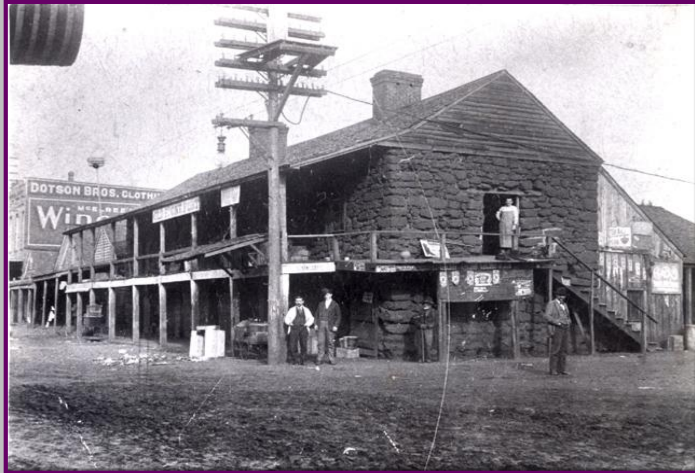
The first Nacogdoches County courthouse was the Old Stone Fort. This vernacular structure built in 1779 was also known as La Casa Piedra due to the Spanish rule over Texas which would continue for the next thirty years. It is easy to see the Spanish influence evident in the architecture of the Stone Fort; walls "made of brick similar to that used in the adobe houses of Spaniards".