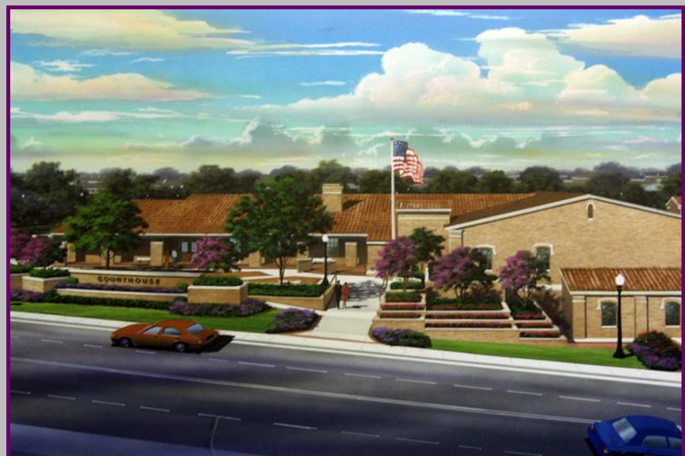
This final courthouse was built in 1960. The most noticeable element of the courthouse is the red tile roof, a great reflection of the Spanish Eclectic style popular between 1915 and 1940. Another aspect of the Spanish Eclectic style is the asymmetrical build to the building which can be seen in the placement of windows and archways. There is also greater emphasis upon this style as seen by the narrow archways towards the entrance of the building. The only elements that do not appear to fit with the Spanish style of architecture are the wider archways and casement windows located on the side of the building and under the red tiled shed roof. These arches show off more of an Italianate style that was popular between 1840 and 1845. The casement windows, a window style popular during the 17 th century, act as a replica of this original style thus bringing a sense of formality to the building.

While interning at the Nacogdoches County Courthouse I became fascinated with the building and its architecture. I soon discovered the current courthouse on West Main St. was only one of five courthouses to be built in the Nacogdoches area. I wanted to learn more about the architectural history of the buildings and the significance of that architecture's time period.